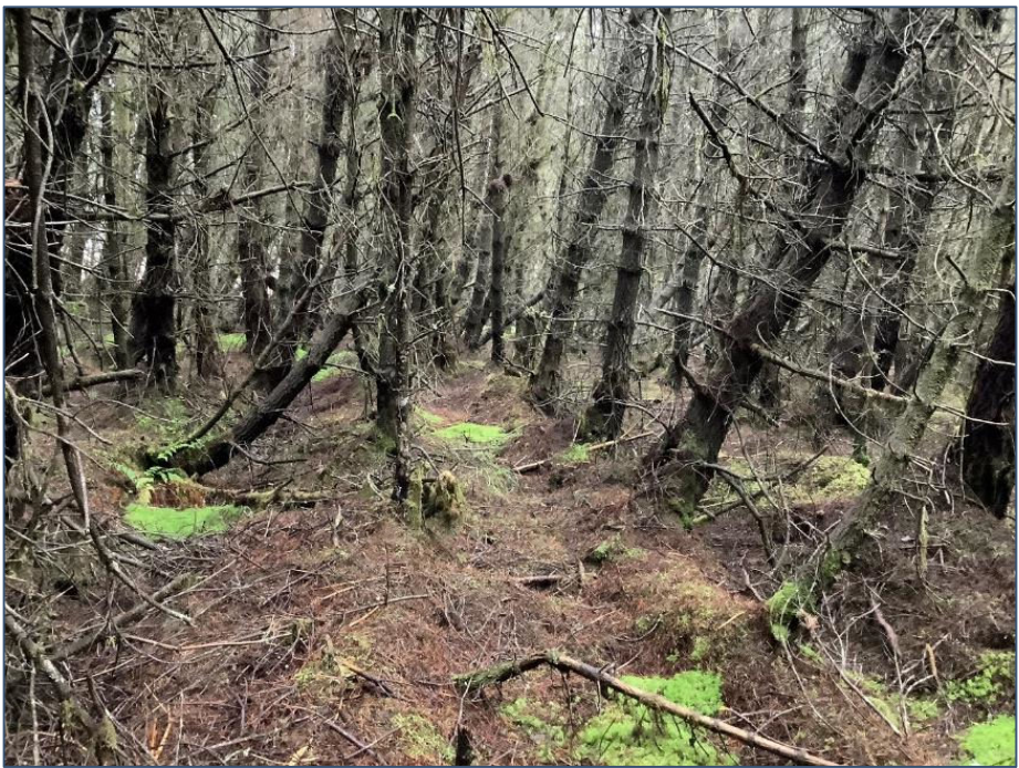
Plate 13.3: Centre of proposed Turbine 1 looking N.