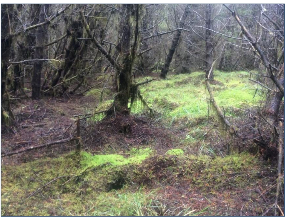
Plate 13.11: Turbine 5 centre-point looking N.