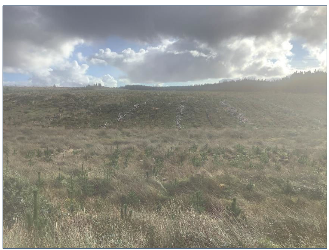
Plate 13.70: View and context (clead-felled) within which CC5 is located looking south.