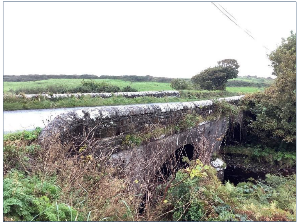
Plate 13.78: Killerduff Bridge along the TDR, NIAH 31300704