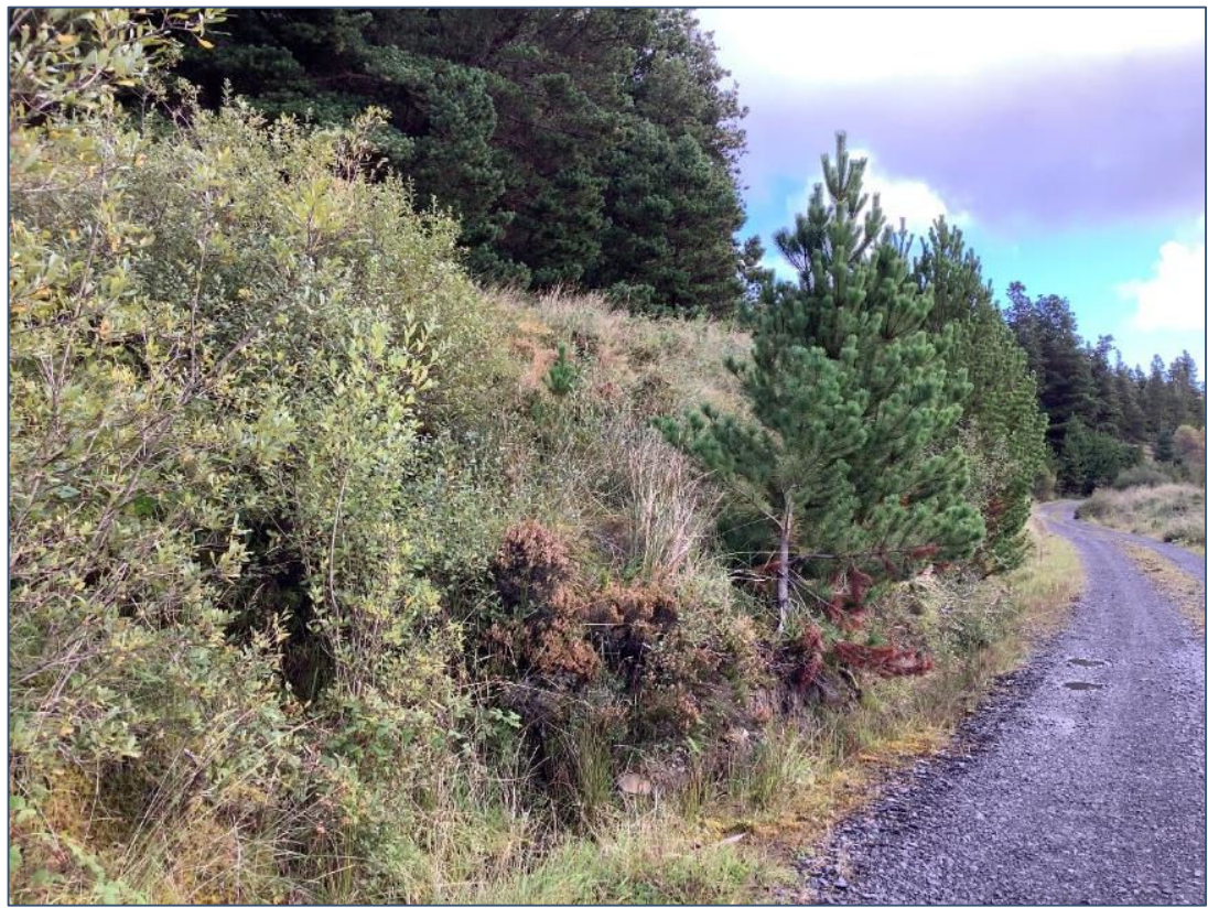
Plate 13.40: Proposed access road to T20 from the west where it meets the existing road, looking ENE.