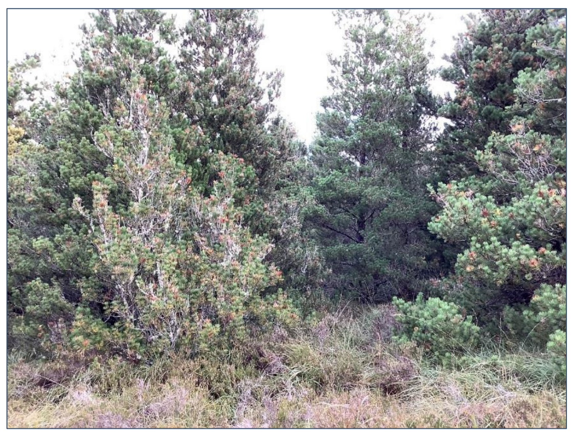
Plate 13.28: View in the direction of T14 taken from EIAR boundary to S, looking NE.