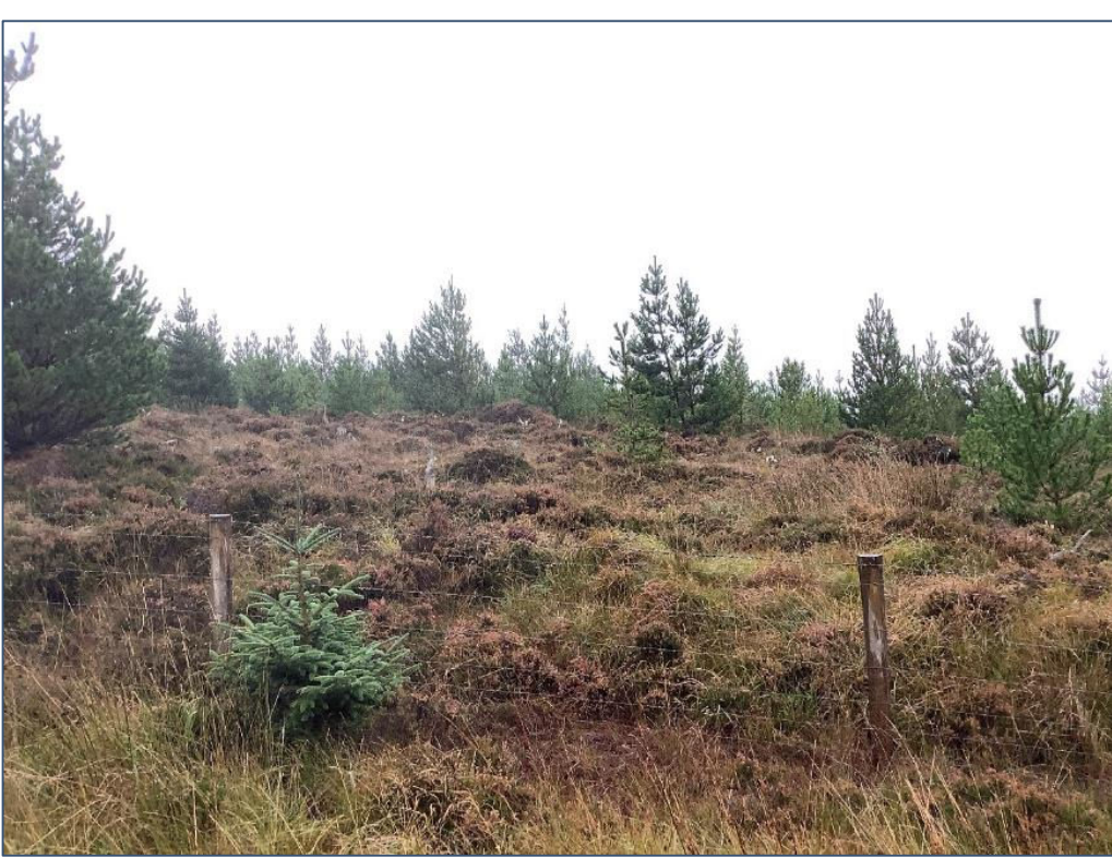
Plate 13.68: CC2 looking south.