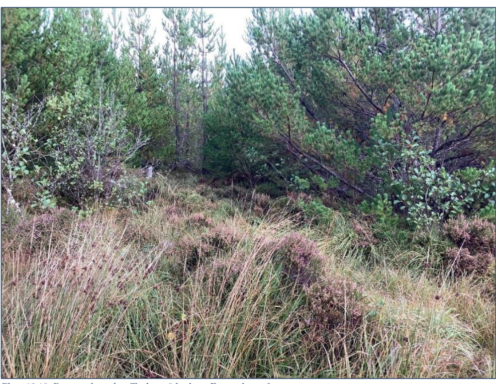
Plate 13.19: Proposed road to Turbine 9 looking E into dense forestry.