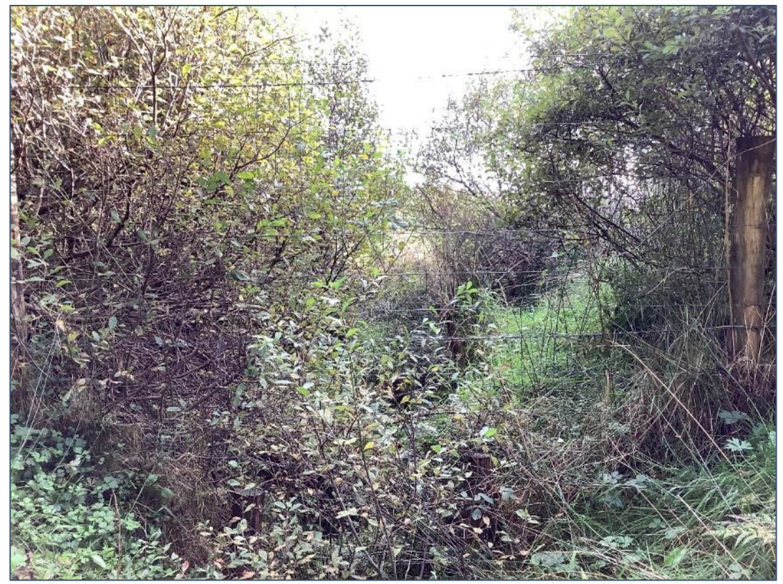
Plate 13.30: Proposed road to T15 from existing road to N, looking SW.