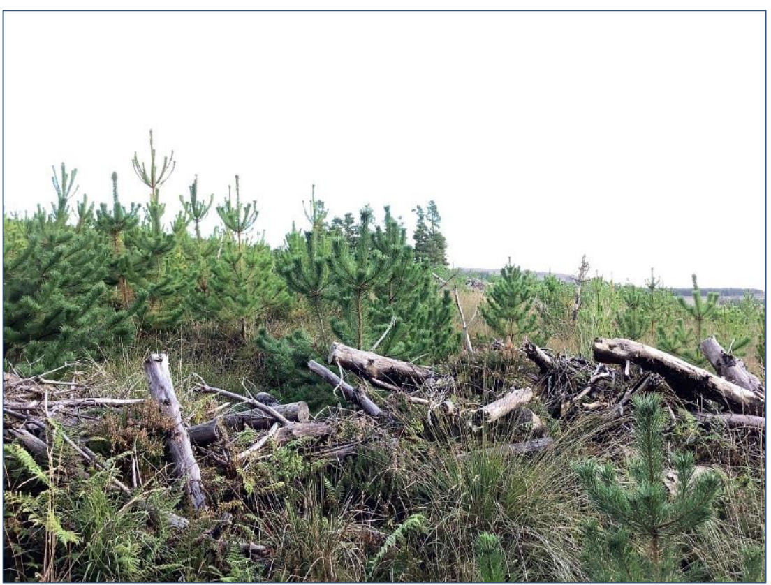
Plate 13.72: CC6 looking east.