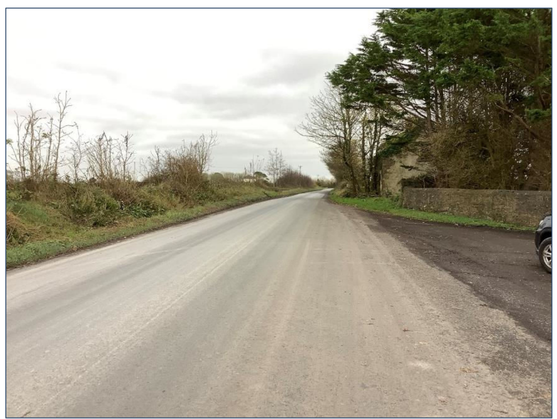
Plate 13.60: Cable route further south at Ballysakeery Church (NIAH 31302204) (Ballysakeery) south of public road.