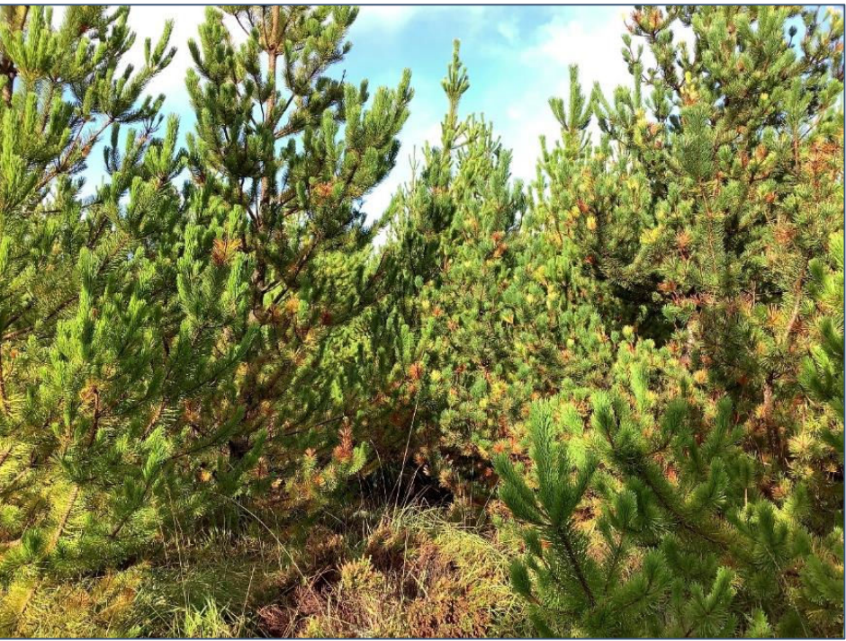
Plate 13.7: Turbine 3 looking W.