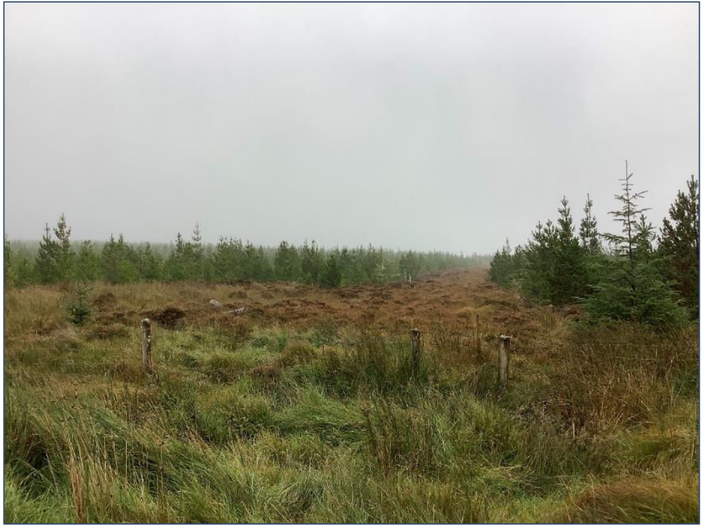
Plate 13.16: Proposed road to T8 along firebreak looking SE, taken form exiting road to N.