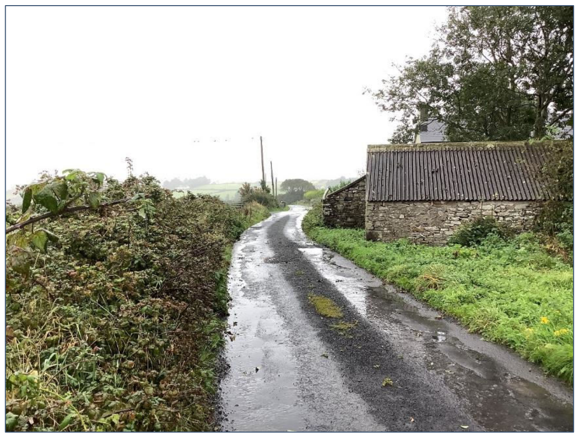
Plate 13.52: Continuation of cable route further east, looking E, adjacent to Megalithic tomb Court tomb MA007-046 at Ballyglass.