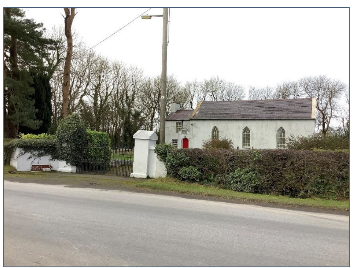
Plate 13.63: Mullafarry Presbyterian Church NIAH 31302206 located to N of cable route, looking N