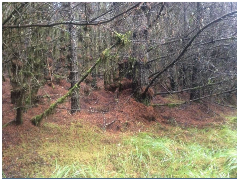
Plate 13.10: Proposed road to Turbine 5 looking NE.