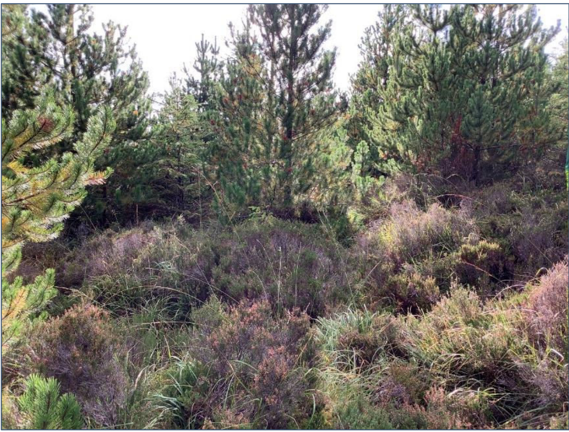
Plate 13.31: Continuation of proposed road to T15 looking SW.