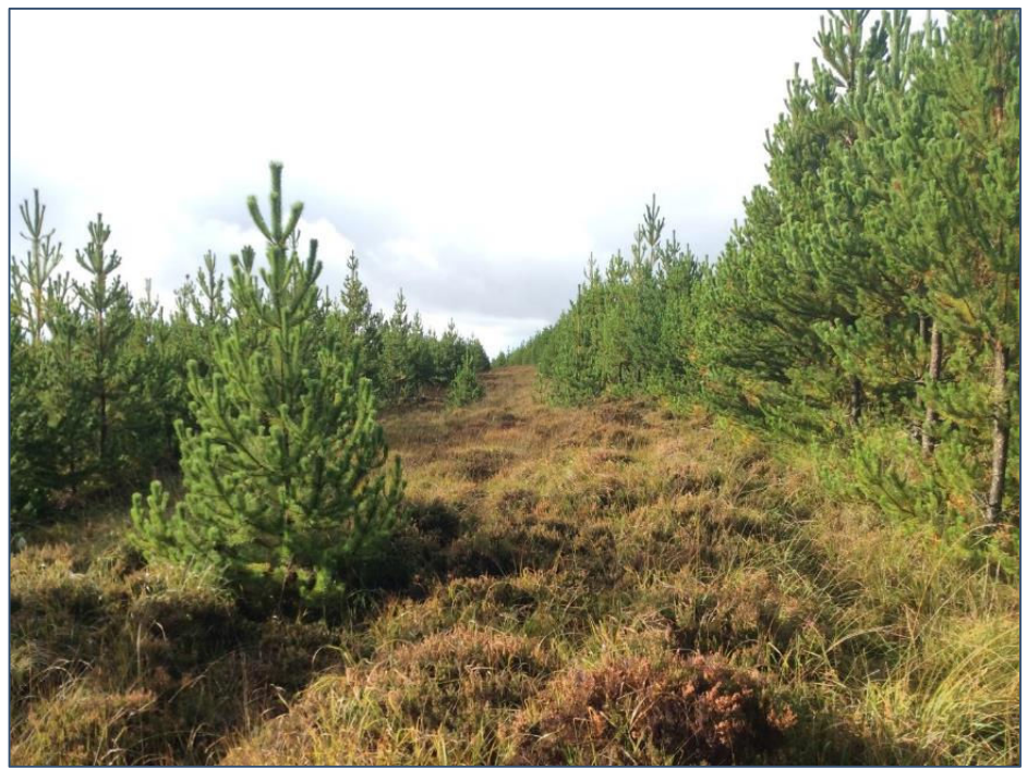
Plate 13.6: Continuation of proposed road to Turbine 3 looking SW.