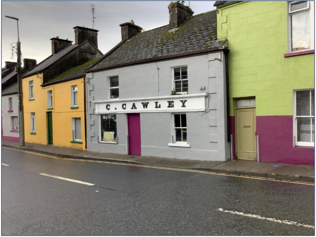
Plate 13.86: NIAH 31205008 on Erris Street in Crossmolina along TDR.