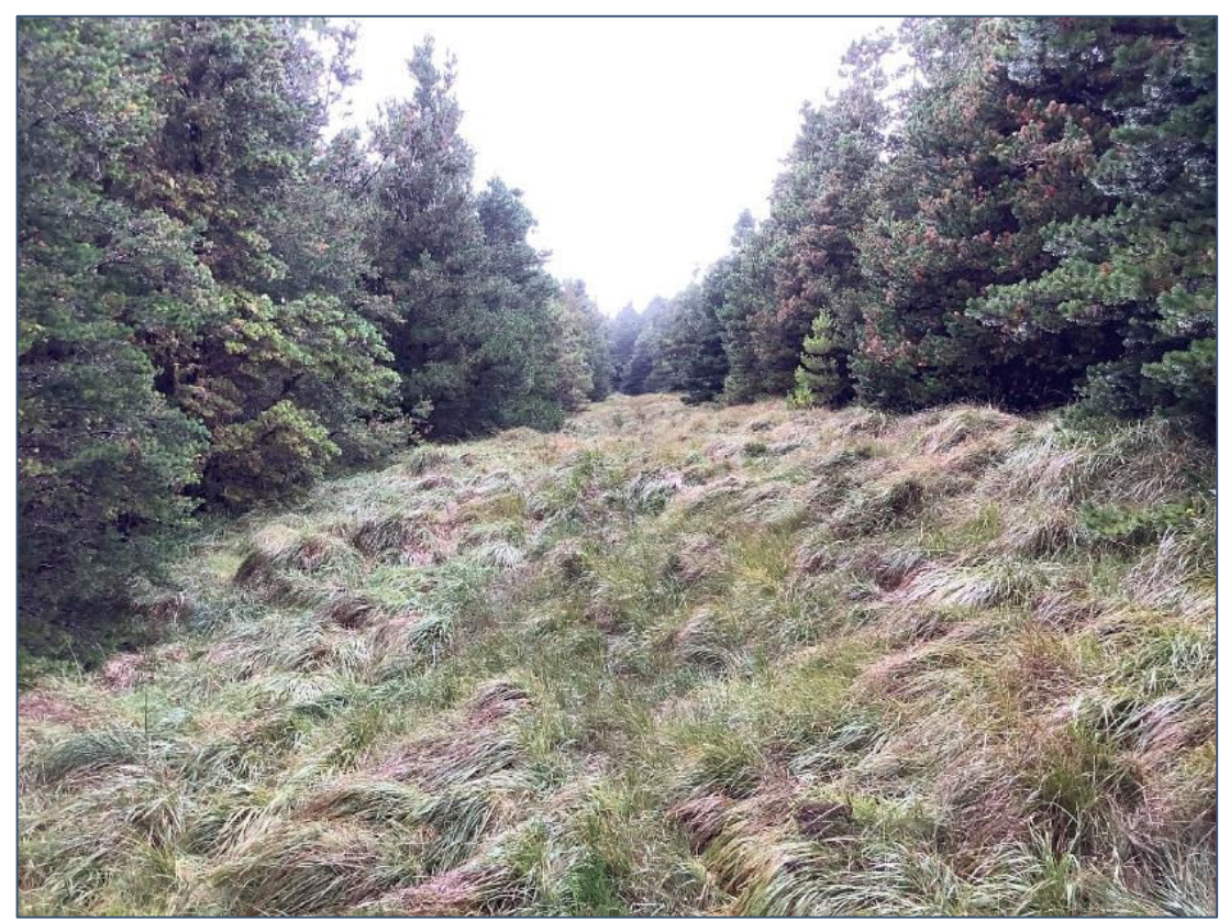
Plate 13.73: Norther borrow pit within mature forestry to left and right of photo looking west.