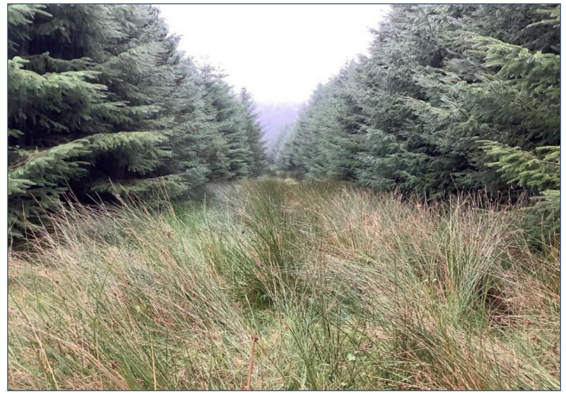
Plate 13.37: Proposed road to T18 crosses this fire break through dense forestry on either side. Photo taken from fire break looking NW.