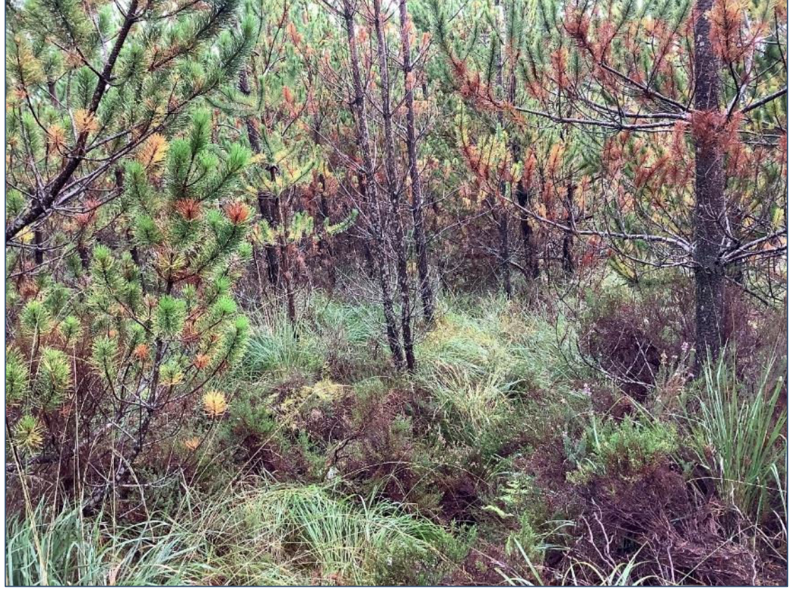
Plate 13.24: Turbine 12 looking S.