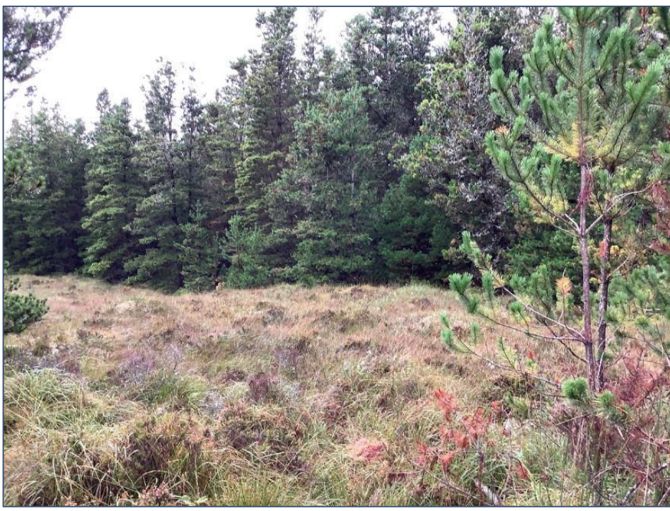
Plate 13.8: Proposed road to Turbine 4 looking SW.