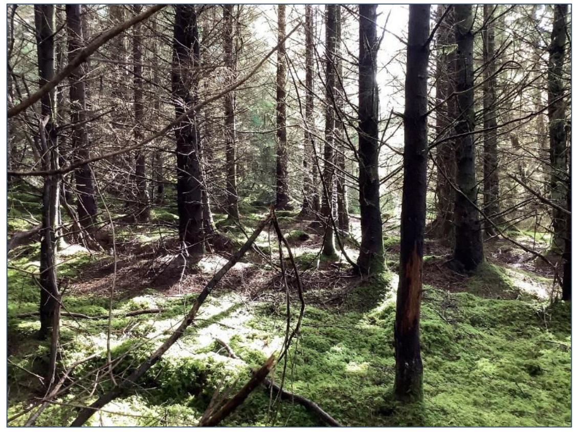
Plate 13.26: Turbine 13 looking S.