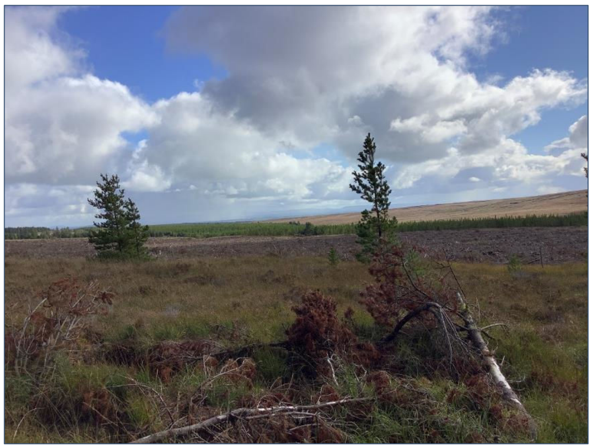
Plate 13.39: Proposed road and location of T19 turbine looking E.