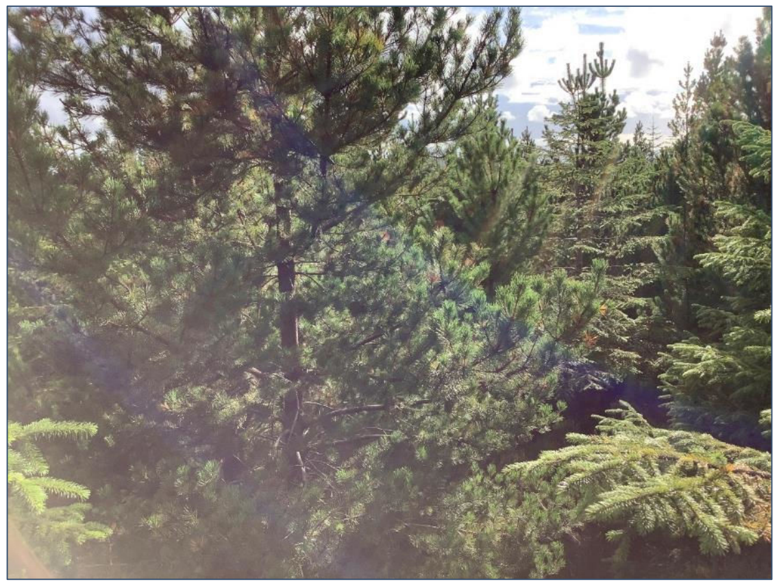
Plate 13.32: Location of T15 looking W in mature dense forestry.