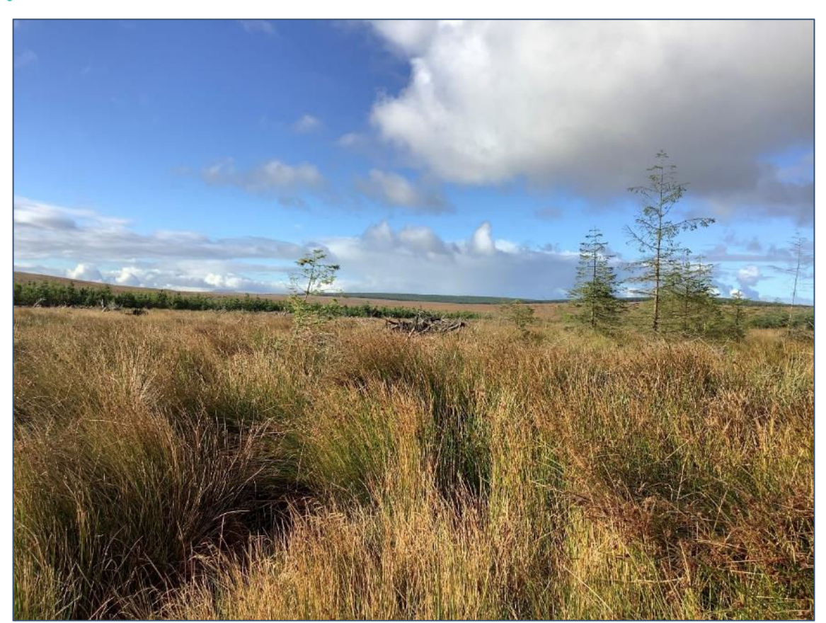
Plate 13.35: Location of T16 looking SW.