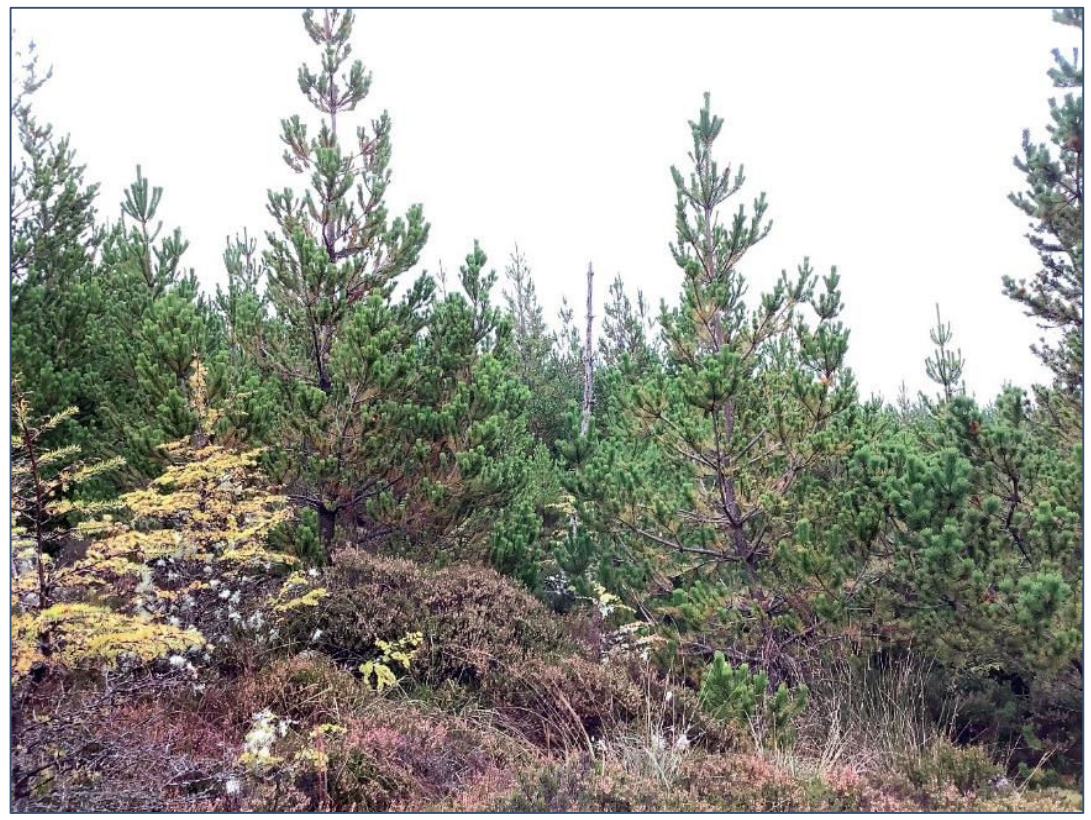
Plate 13.22: Location of proposed turbine (T11) looking E.