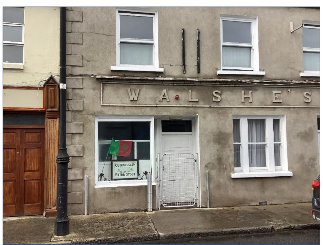
Plate 13.87: NIAH 31205006 at Church Street Crossmolina along TDR.