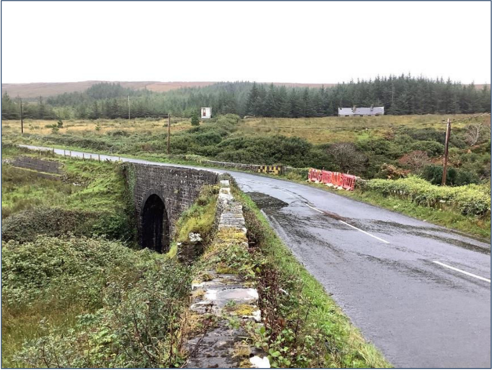
Plate 13.79: Bridge at Glenulra NIAH 31300605 along the TDR.