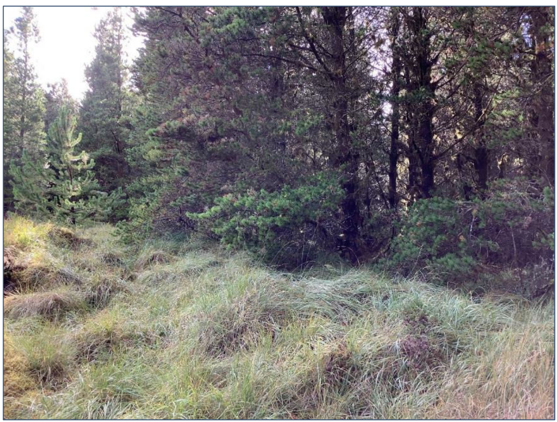
Plate 13.29: Proposed road to T14 from the north looking S.