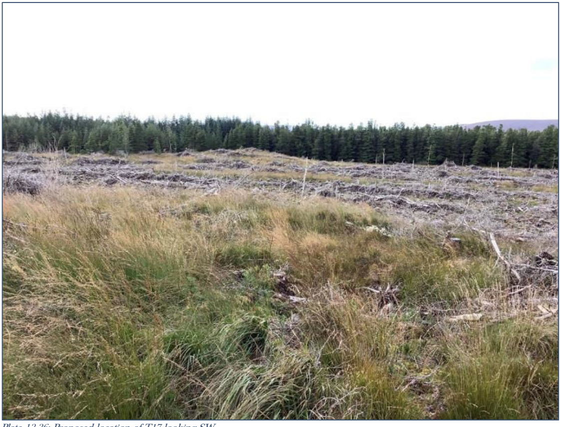
Plate 13.36: Proposed location of T17 looking SW.