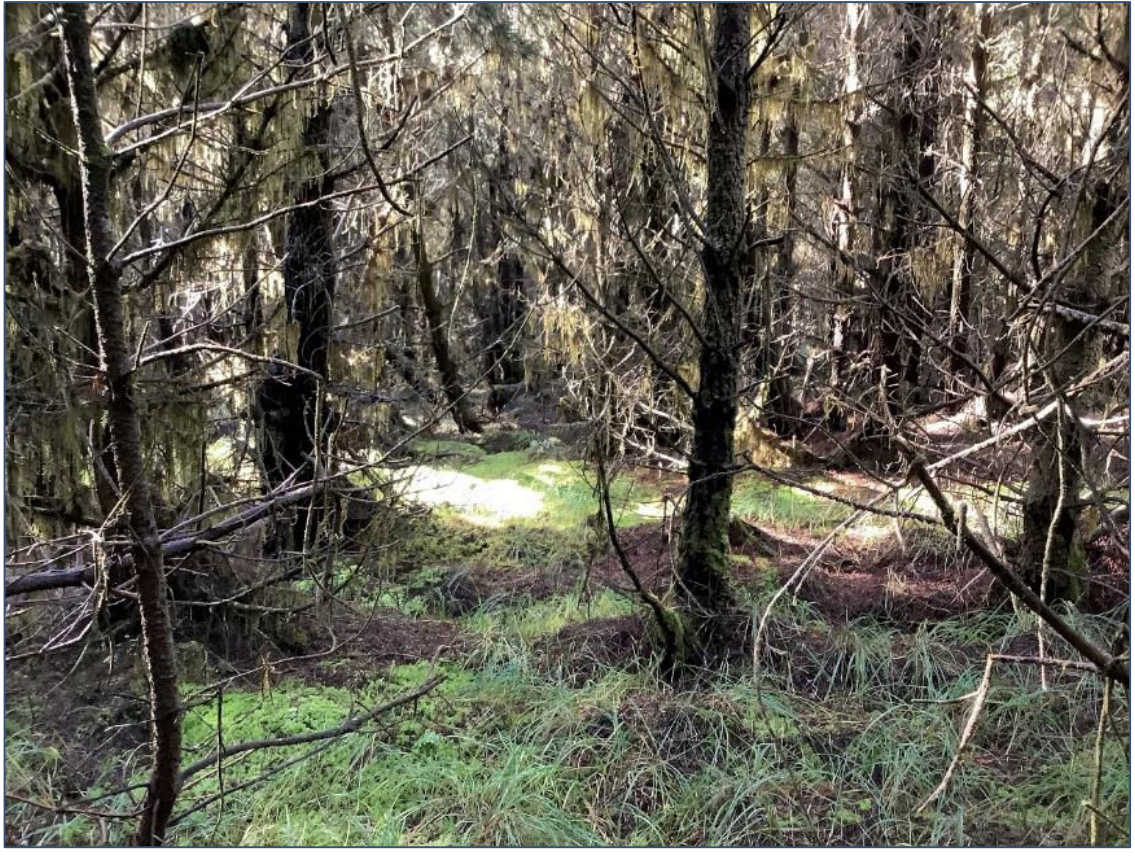
Plate 13.75: Southern borrow pit looking west.