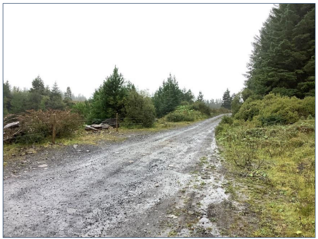
Plate 13.50: Grid connection cable route further NE looking SW.