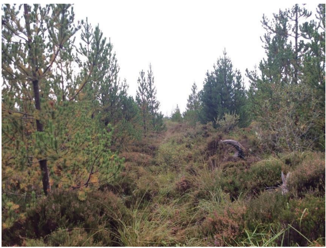
Plate 13.67: CC1 looking south.