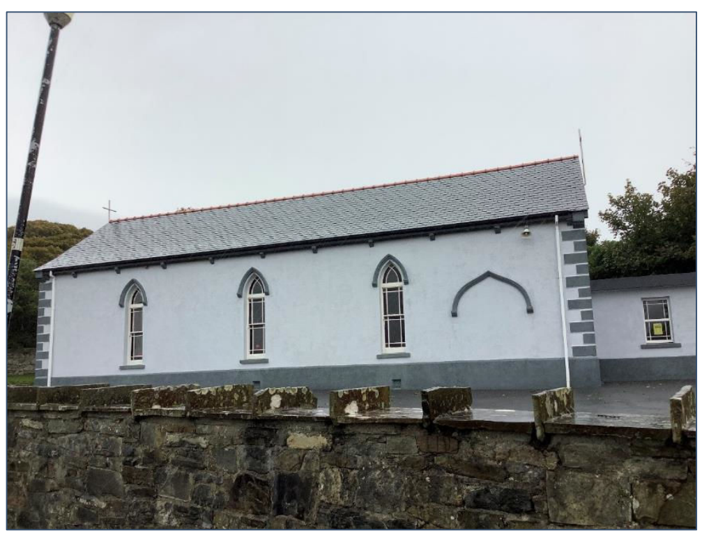
Plate 13.81: Saint Teresa's Catholic Church NIAH 31300602 at Belderg More along TDR looking E.