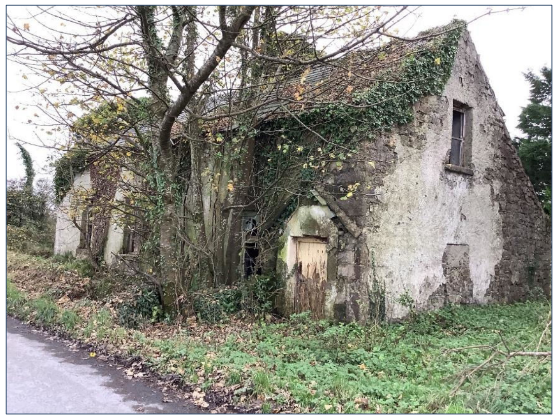
Plate 13.62: School at Lisglennon (NIAH 31302205) adjacent to church and graveyard looking S.