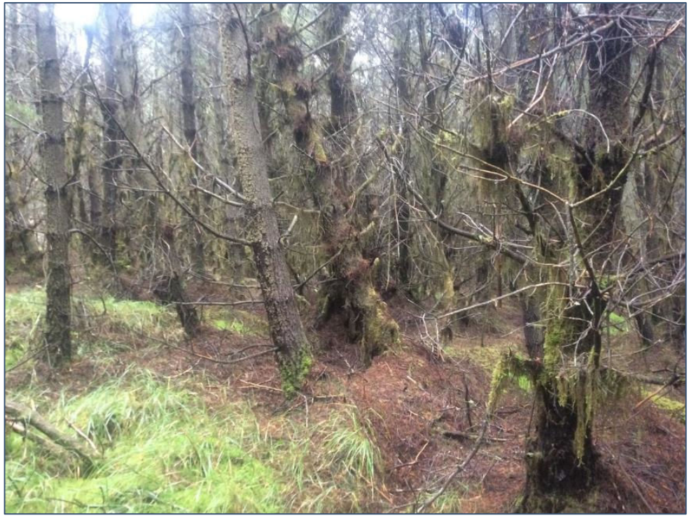
Plate 13.12: Proposed road from T5 to T20 through mature forest looking E.