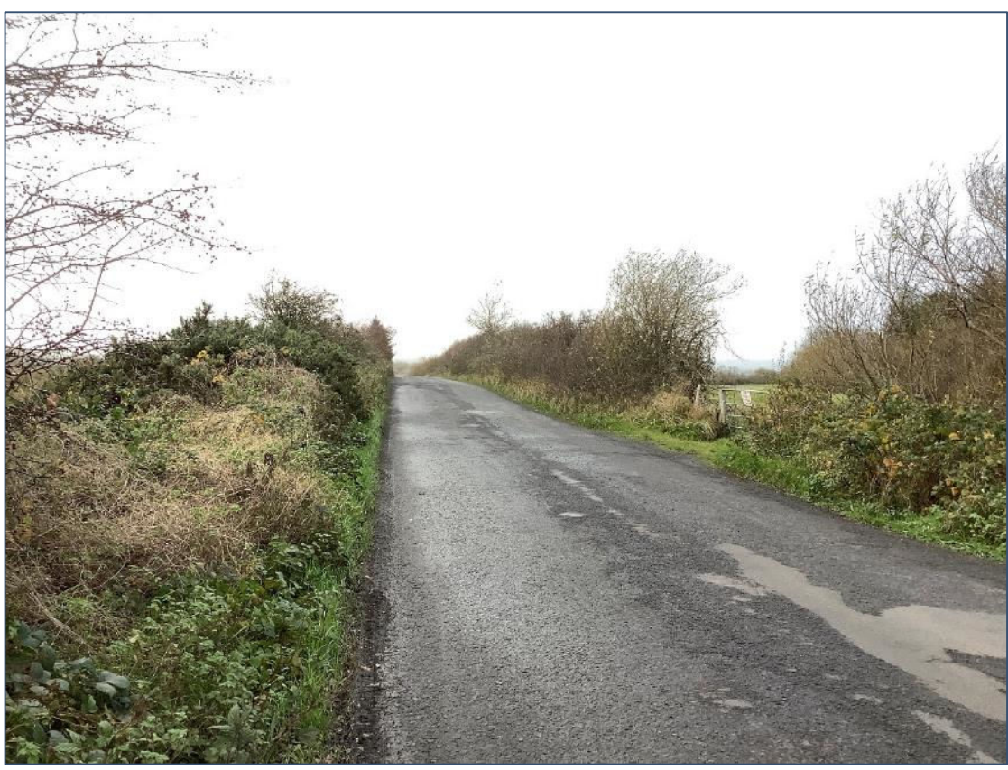
Plate 13.59: Continuation of proposed grid connection route further south looking N.