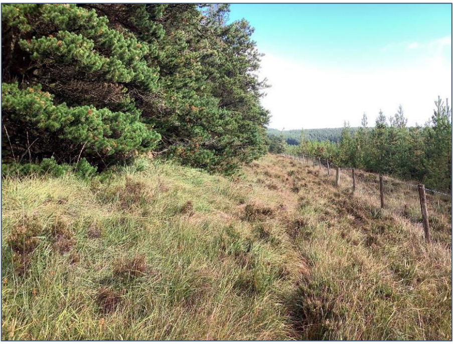
Plate 13.1: Proposed road to turbine 1 looking NE.