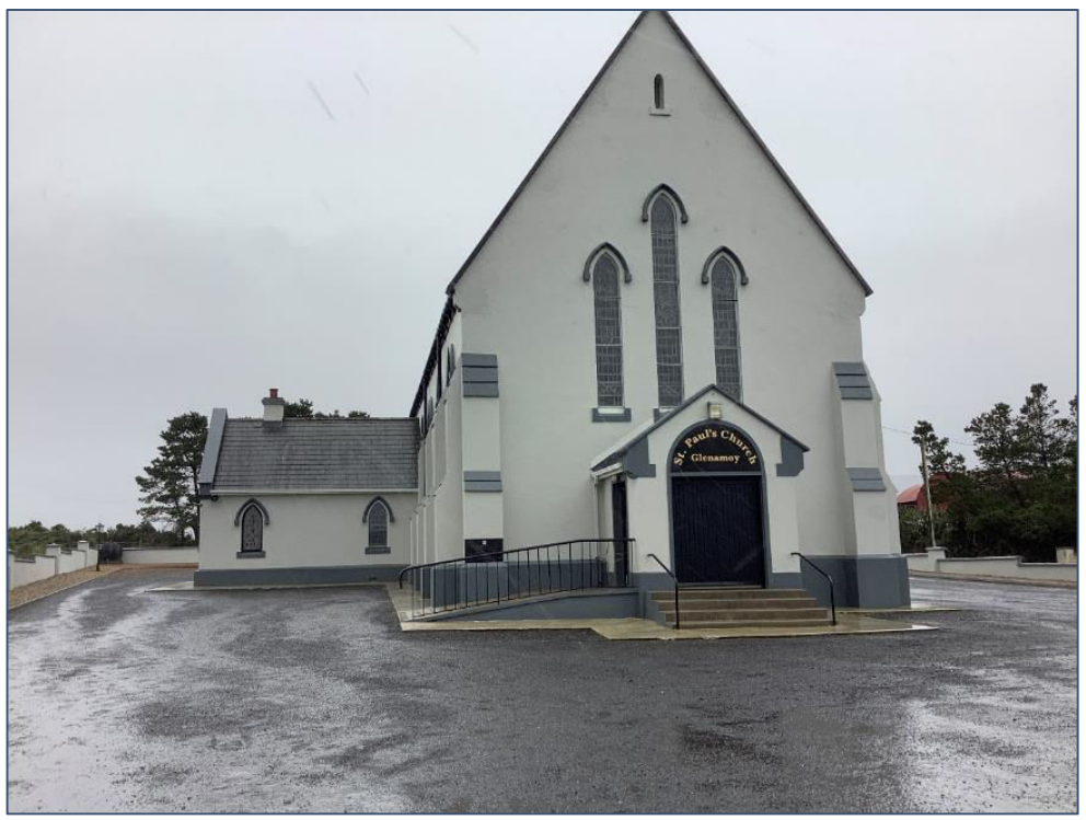
Plate 13.82: St Paul's Church at Glenamoy NIAH 31301201 at Bunalty TD.