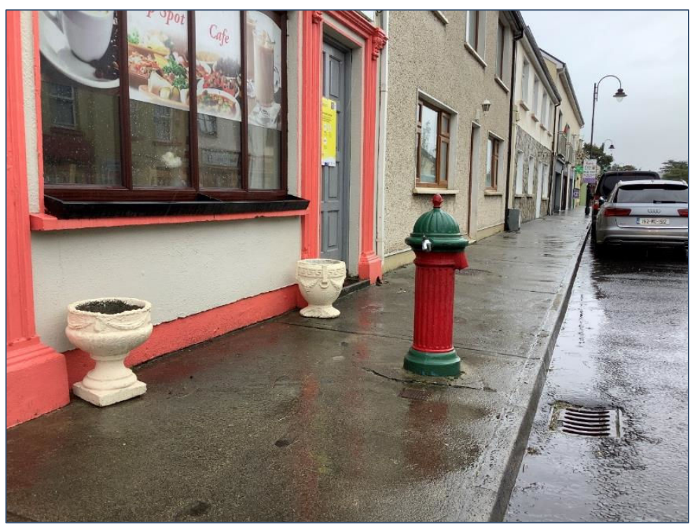
Plate 13.83: Water pump NIAH 31302603 located along TDR on Main Street Bangor.