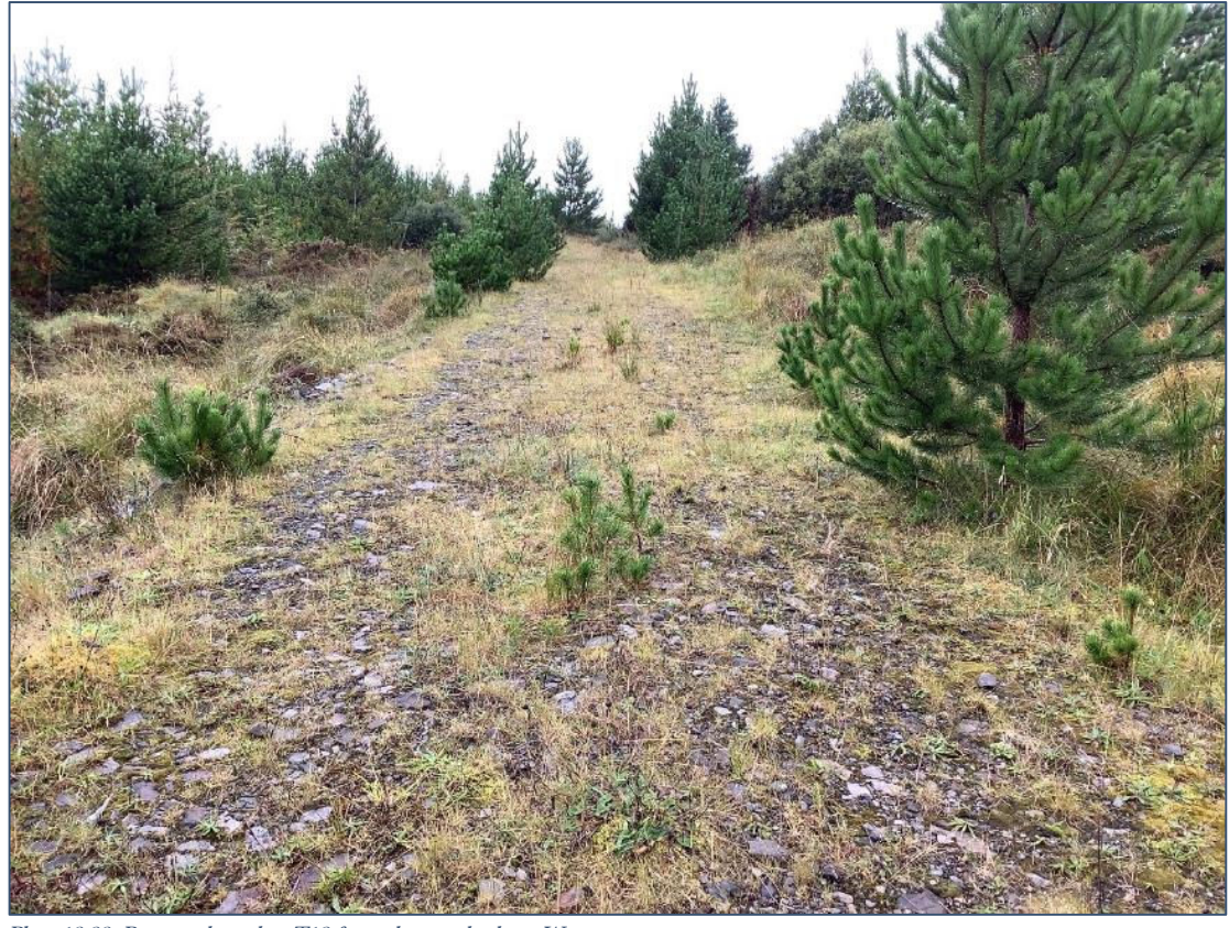
Plate 13.23: Proposed road to T12 from the east looking W.