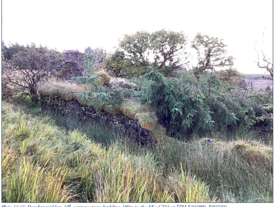
Plate 13.45: Derelict mid-late 19th century stone building 180m to the SE of T21 at ITM E505889, N833391