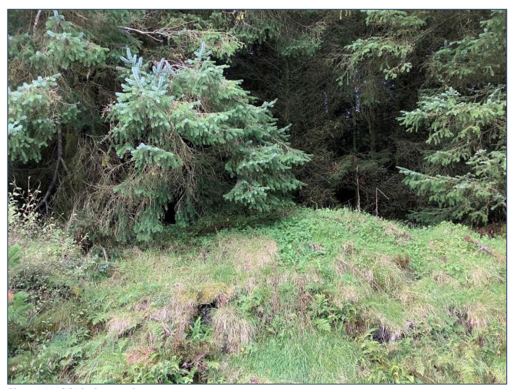
Plate 13.69: CC3 looking northwest.