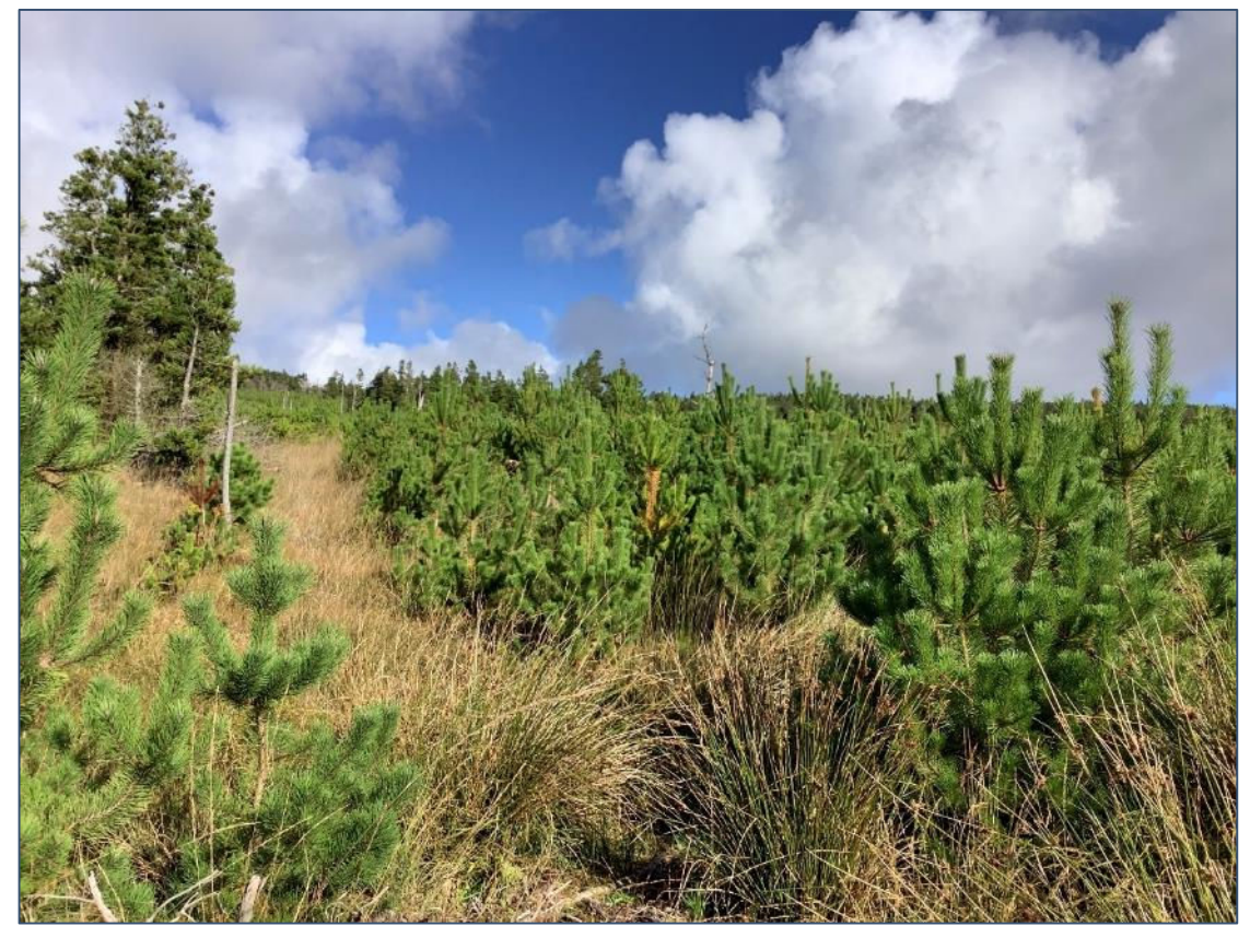
Plate 13.43: Proposed road to T21 from the southwest looking NE.