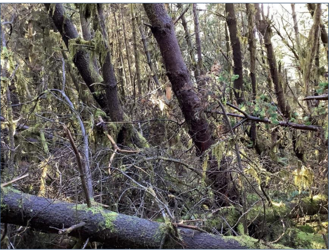
Plate 13.44: T21 turbine looking S.