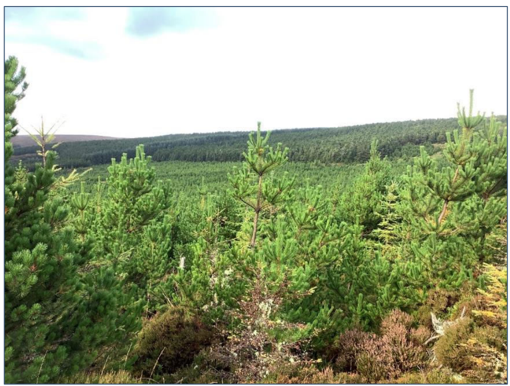
Plate 13.15: Proposed turbine T7 looking N.