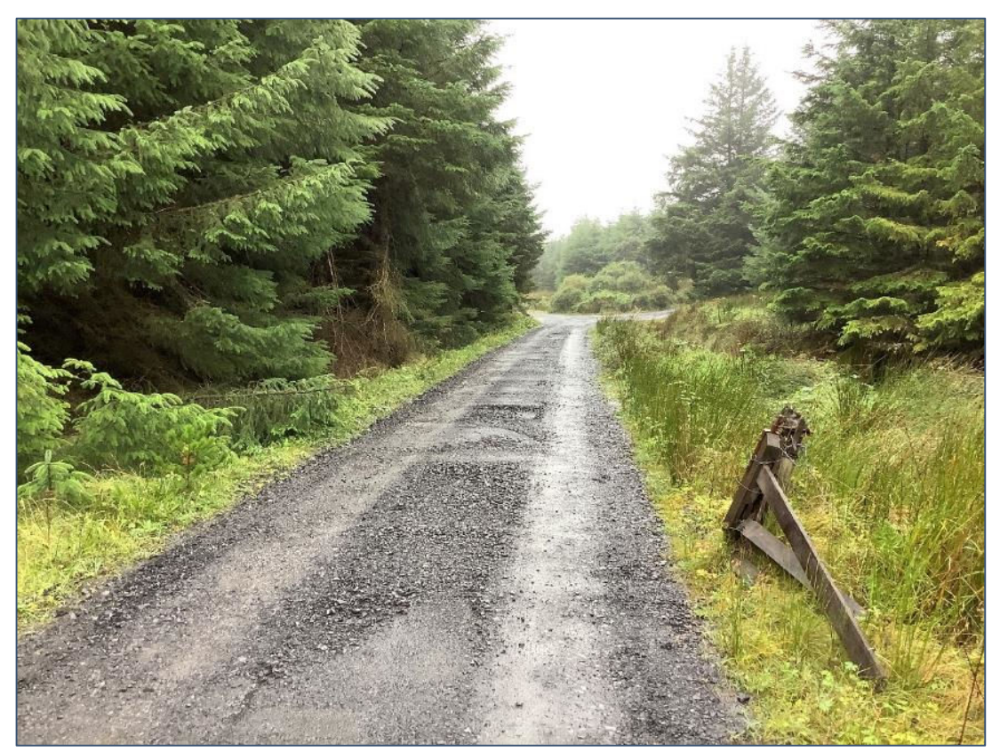
Plate 13.65: Road from which substation site will be accessed (substation site within mature forest to left of photo).