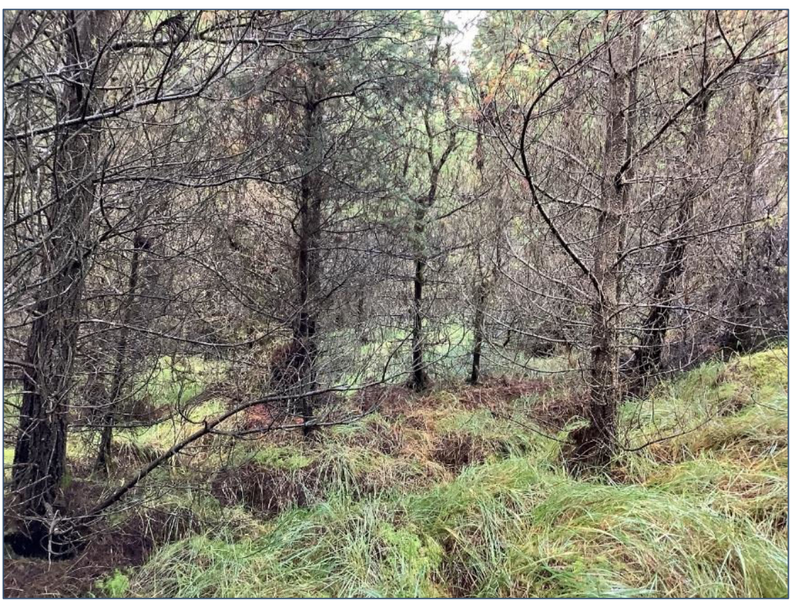
Plate 13.42: Location of T20 looking W.