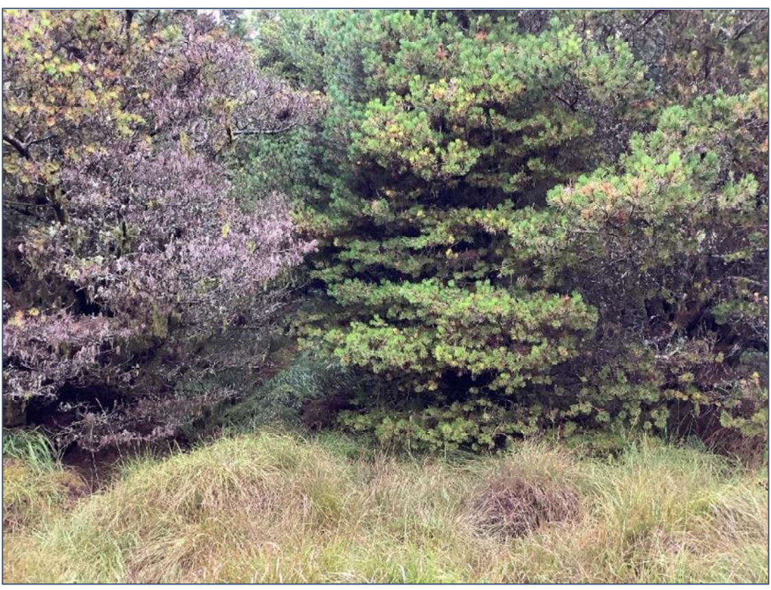
Plate 13.74: Centre of northern borrow pit looking north into mature forestry.