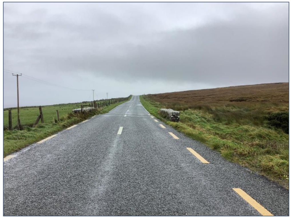
Plate 13.80: Un-named Bridge at ITM E504356, N841007 looking E.