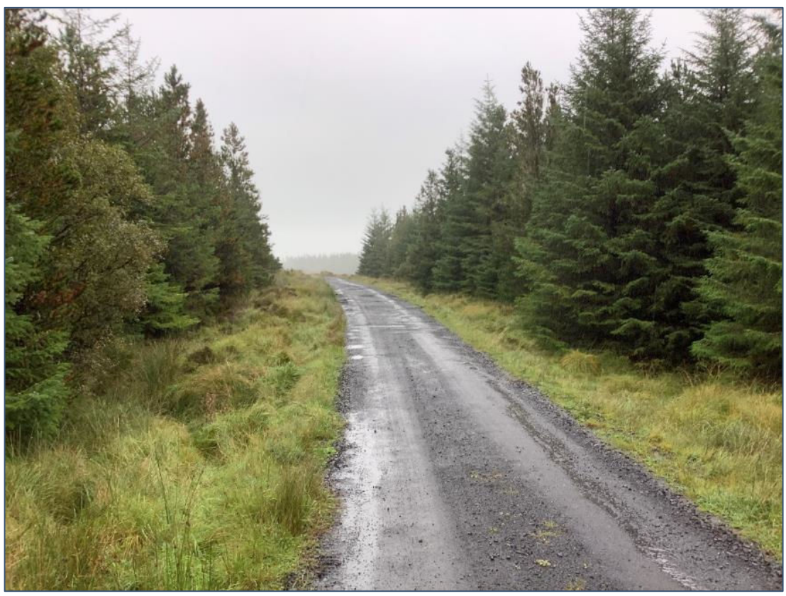
Plate 13.49: Grid connection cable route looking NE after it leaves wind farm site.