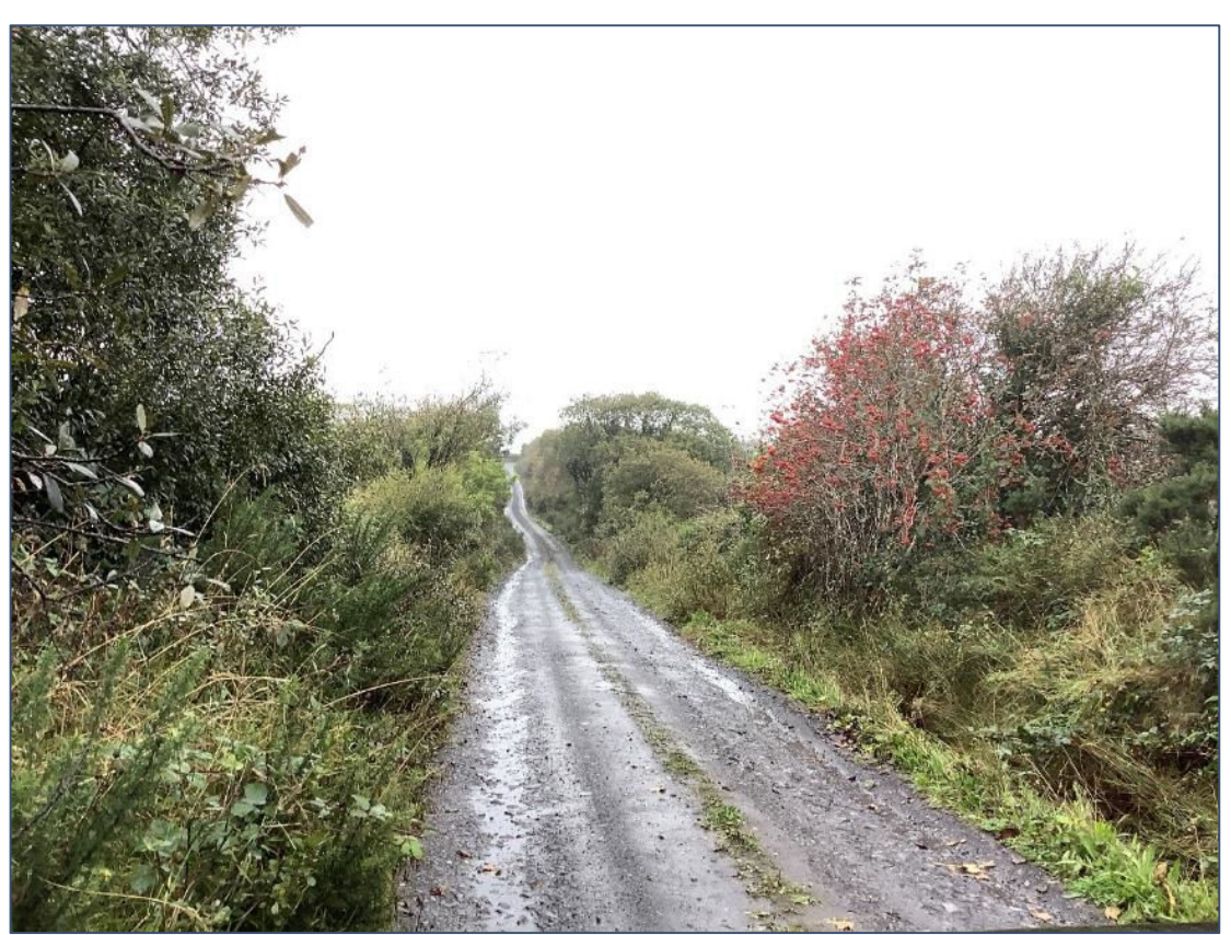
Plate 13.51: Grid connection cable route looking NE.