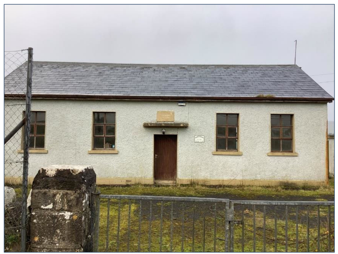
Plate 13.55: Annaghmore national school located to E of regional road along which the proposed underground grid connection route extends.