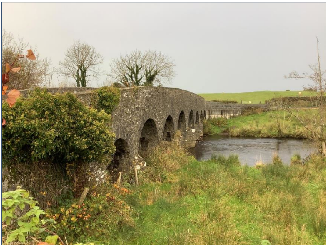
Plate 13.58: Tonrehown Bridge at Ballinagavna, / Lecarrowanteean Td.s along cable route.