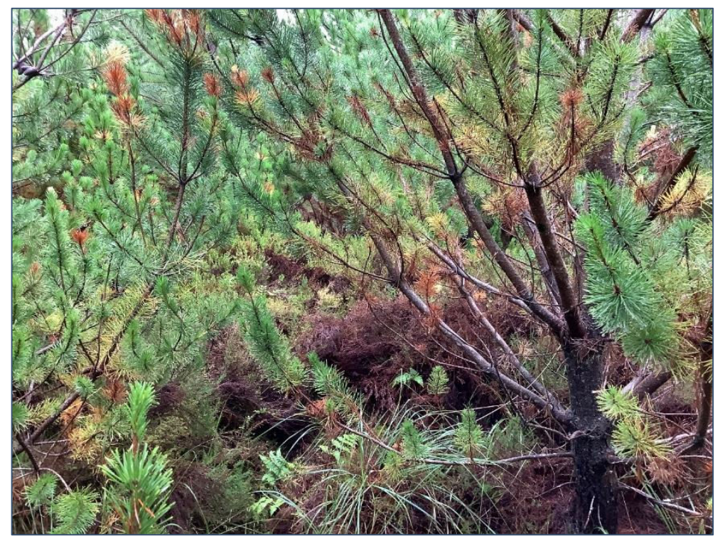
Plate 13.14: Turbine 6 in mature dense forestry looking SE.