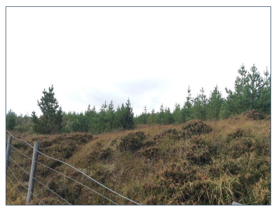
Plate 13.5: Proposed road to turbine 3 looking SW.