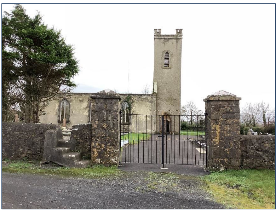
Plate 13.61: Lisglennon Td. where Ballysakeery Church is located. (NIAH 31302204)