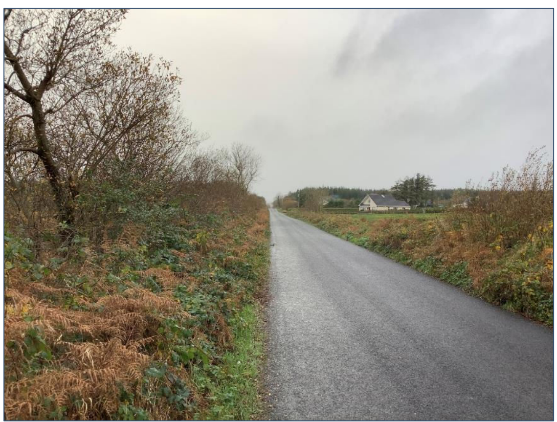
Plate 13.56: Continuation of cable route looking E.