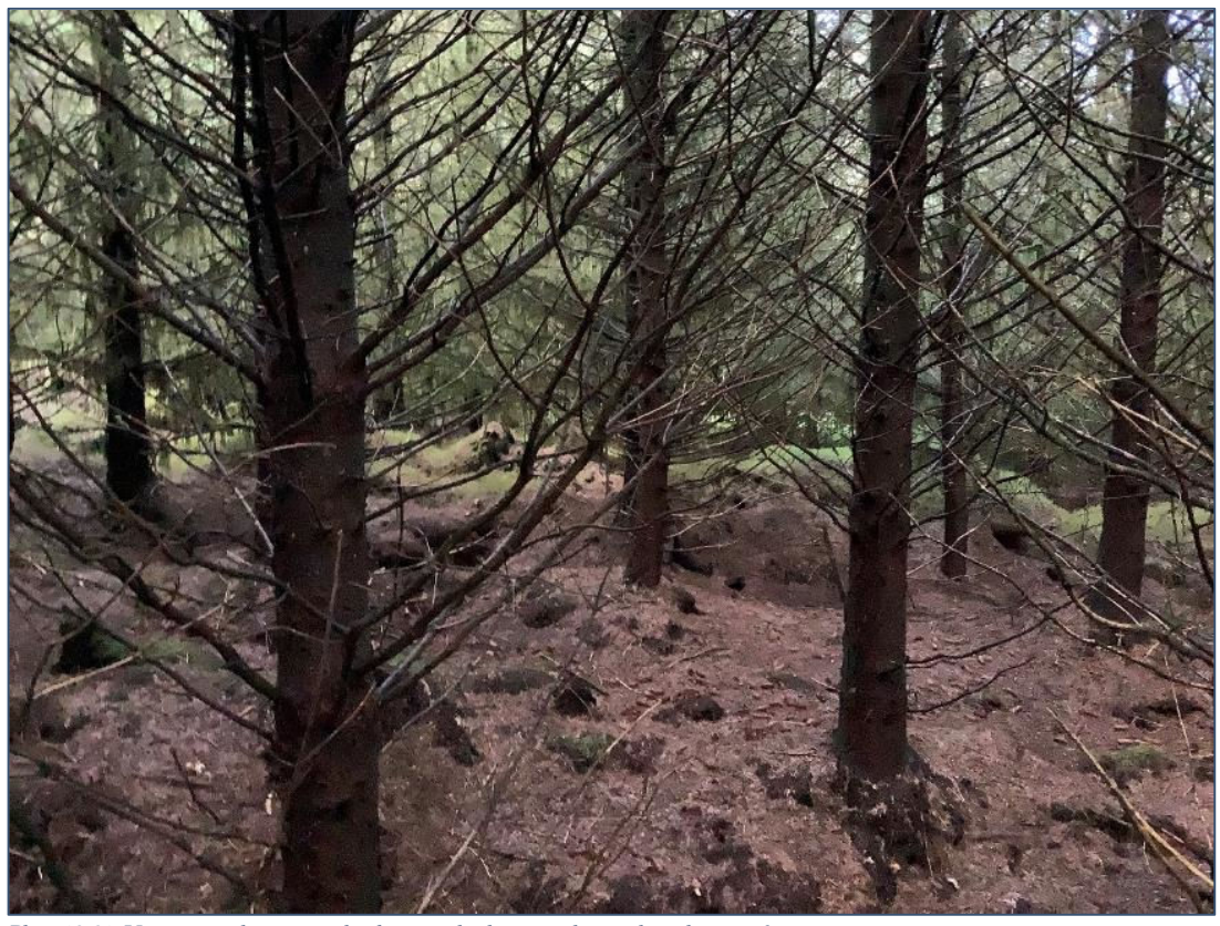
Plate 13.64: View towards proposed substation looking north-east though sense forestry.