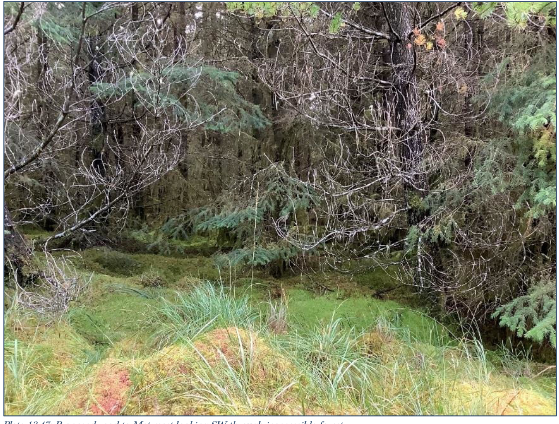
Plate 13.47: Proposed road to Met mast looking SW through inaccessible forest