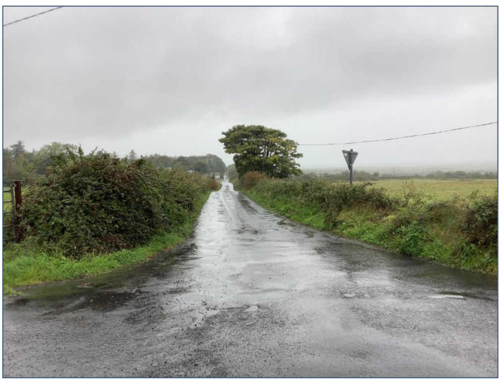
Plate 13.77: Proposed TDR just to E of Court Tomb MA007-046 looking north.

The route leaves the N59 at Bangor Erris, linking up to the R313 before turning north along the L1204. The route then turns east on the R314 to Ballycastle where the R314 to Ballyglass link road will be used to access the site. TDR accommodation works are proposed at a location along the L1204 and the junction of L1204/R314.