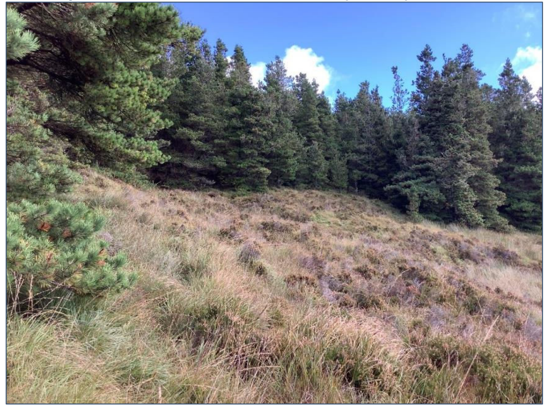
Plate 13.41: Continuation of proposed road to T20 further E looking E into mature forest.