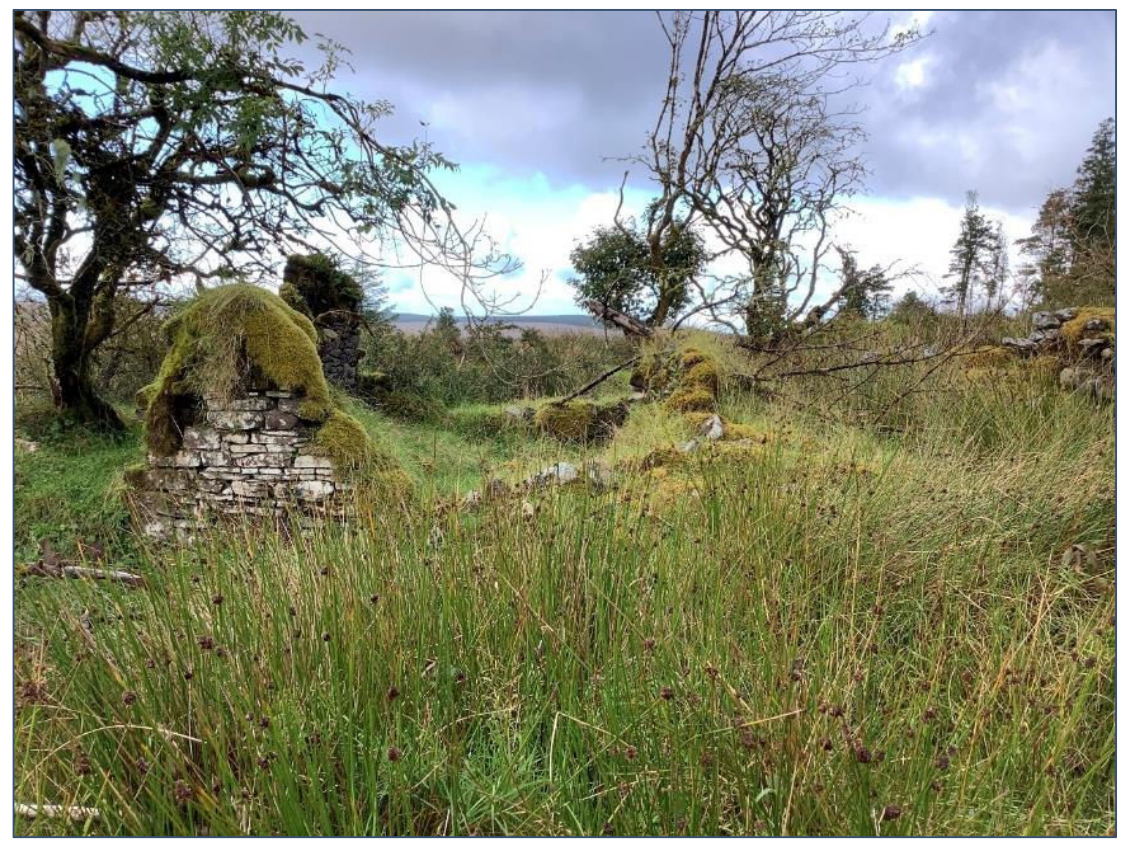
Plate 13.46: As above..