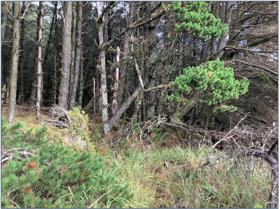
Plate 13.2: Proposed road to Turbine 1 looking N.