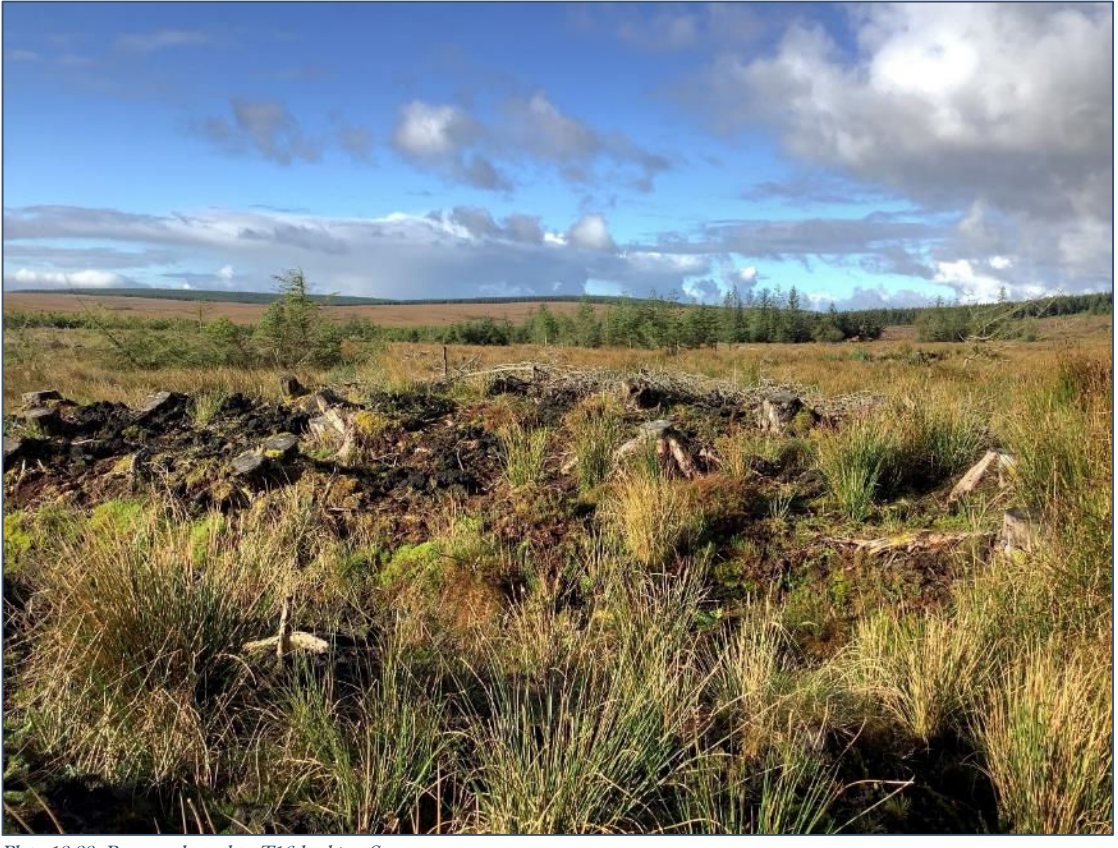
Plate 13.33: Proposed road to T16 looking S.