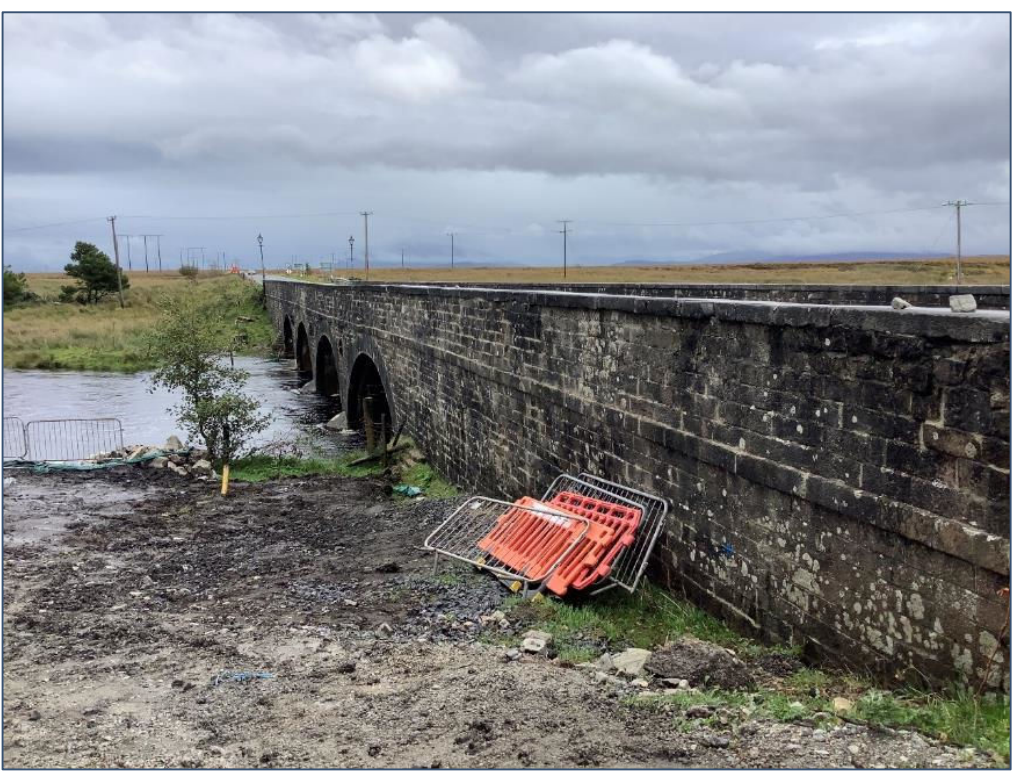
Plate 13.85: Bellacorick Bridge NIAH 31302702 along the TDR.