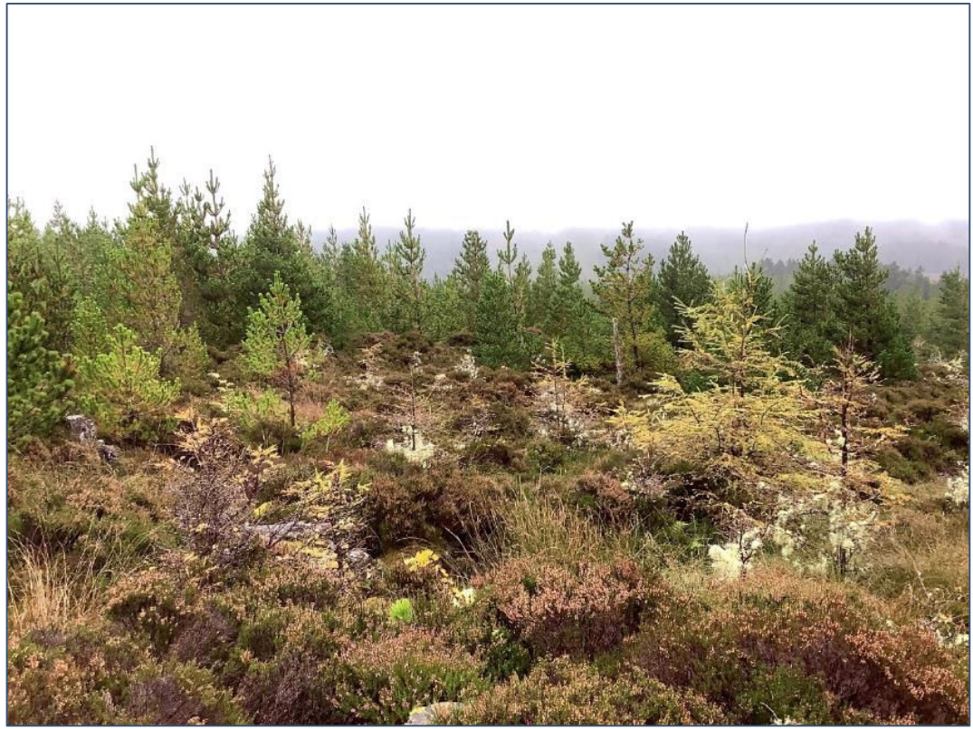
Plate 13.21: Proposed road to T11 looking NE.