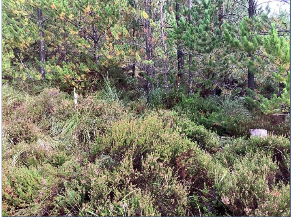
Plate 13.20: Turbine 9 centre point looking NE.