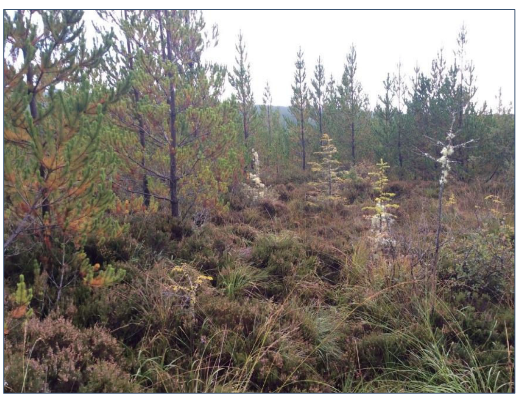
Plate 13.66: Centre of CC1 looking east.