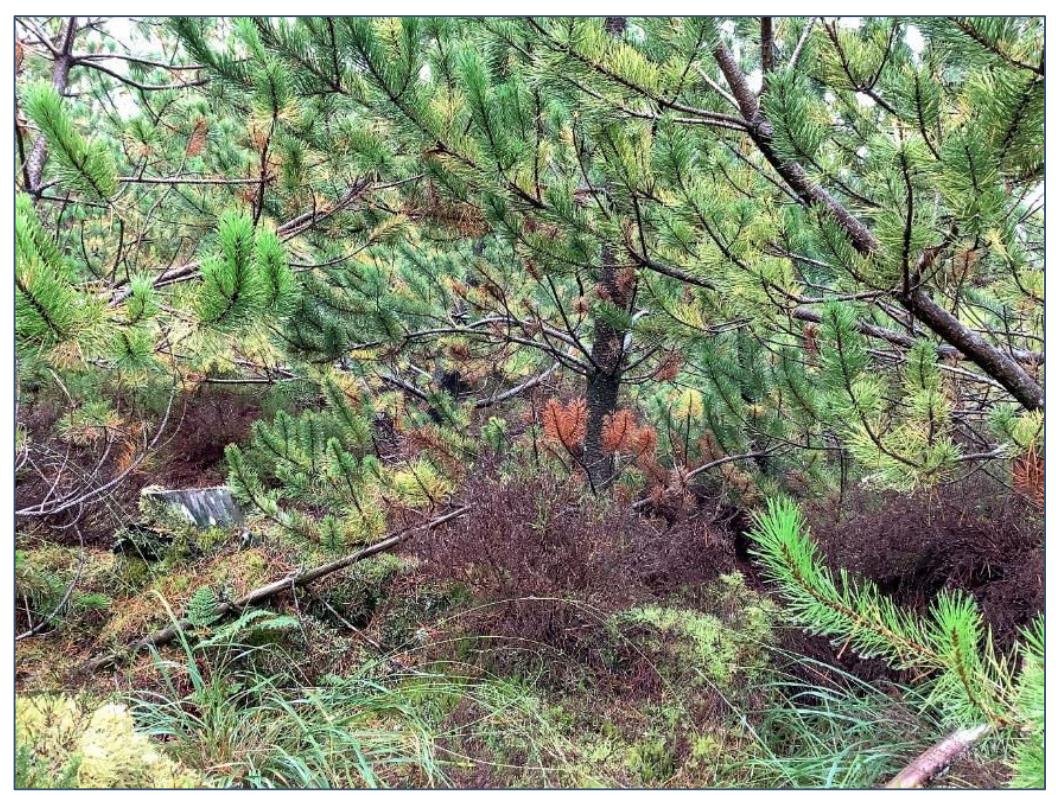
Plate 13.18: Turbine 8 in dense forestry looking S.