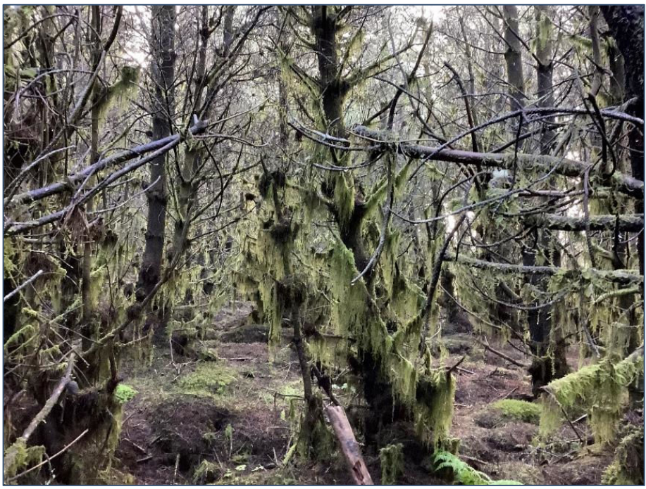
Plate 13.4: Centre of proposed turbine 2 looking E.