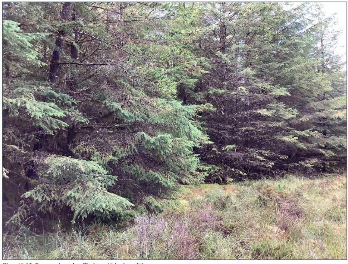
Plate 13.25: Proposed road to Turbine 13 looking W.