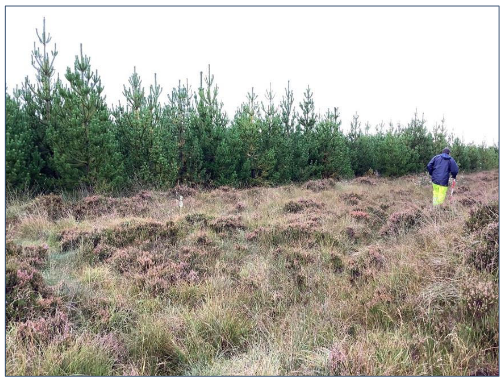
Plate 13.13: Proposed road through forestry to T6 looking S.