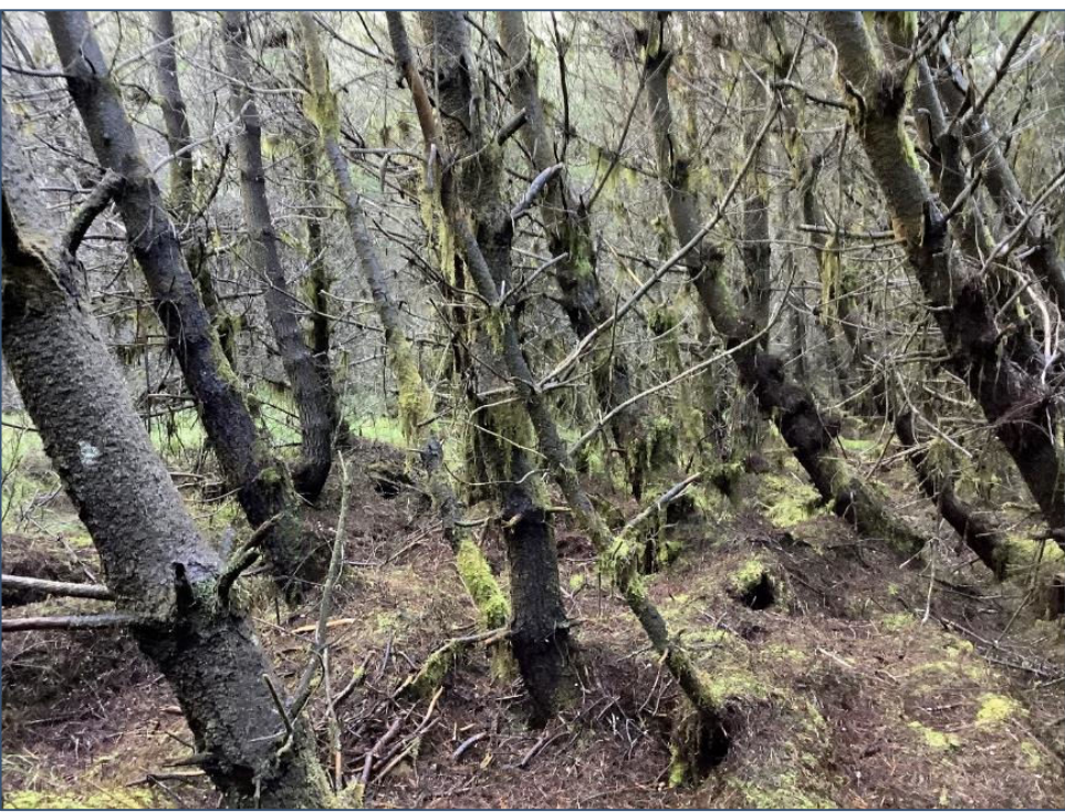
Plate 13.9: Centre of Turbine 4 looking S.