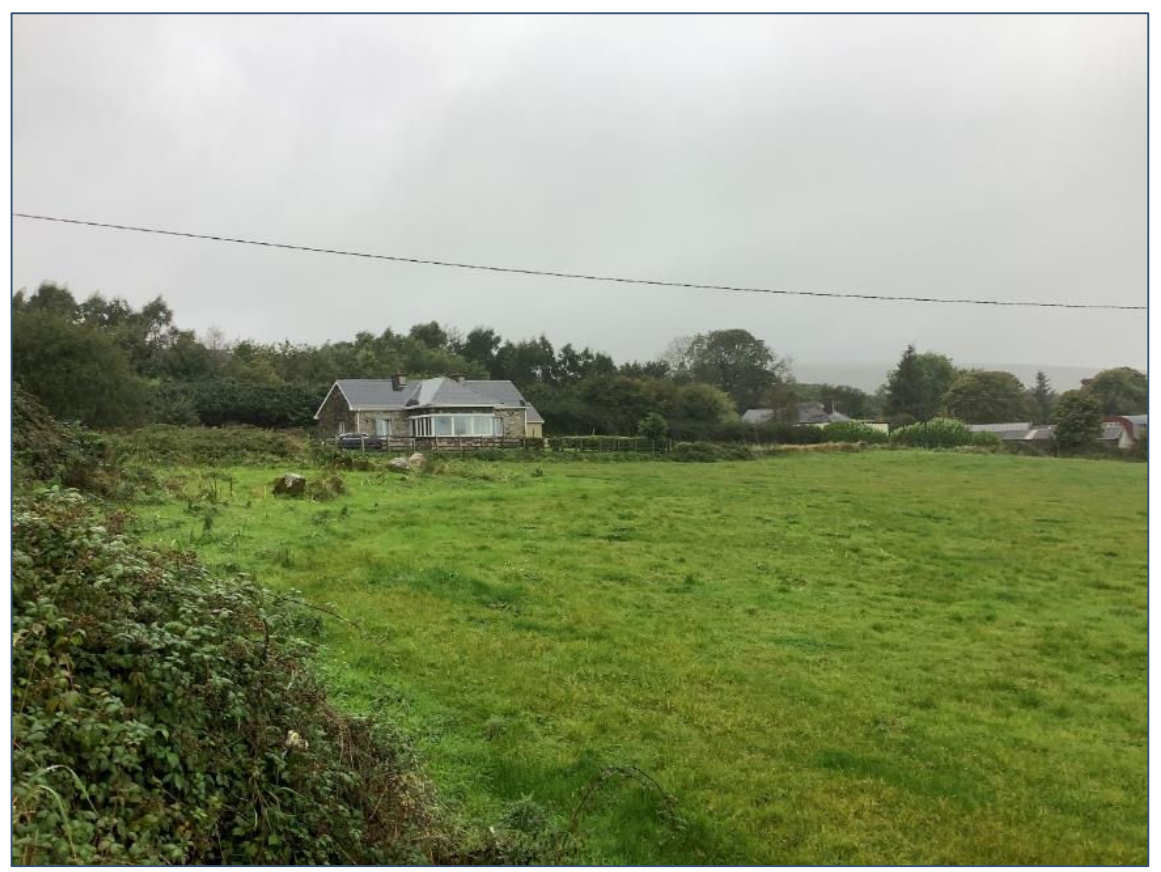
Plate 13.53: Remains of Court tomb MA007-046 at Ballyglass taken from public road along which the proposed underground grid connection cable route extends.