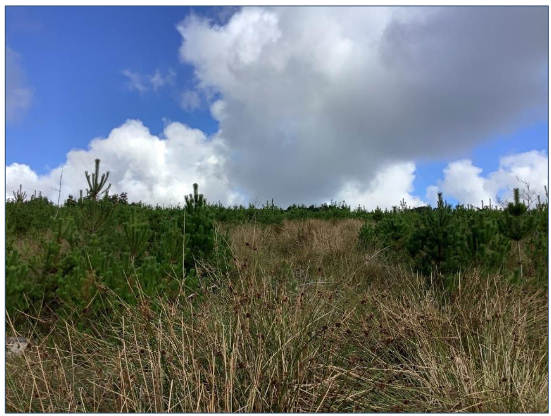
Plate 13.71: CC6 looking north.