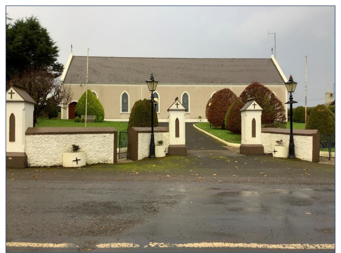
Plate 13.57: Sacred Heart Church NIAH 31302105 at Kincon TD.