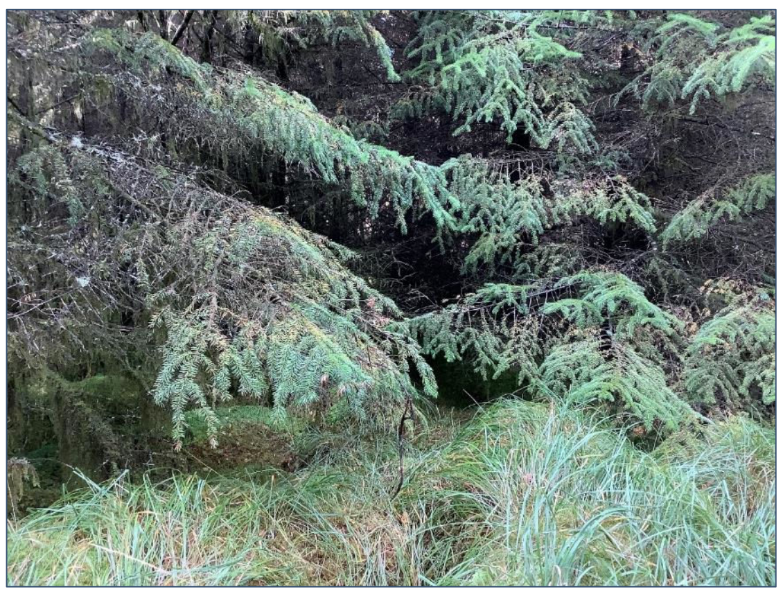
Plate 13.48: Proposed road to Met mast looking NE.