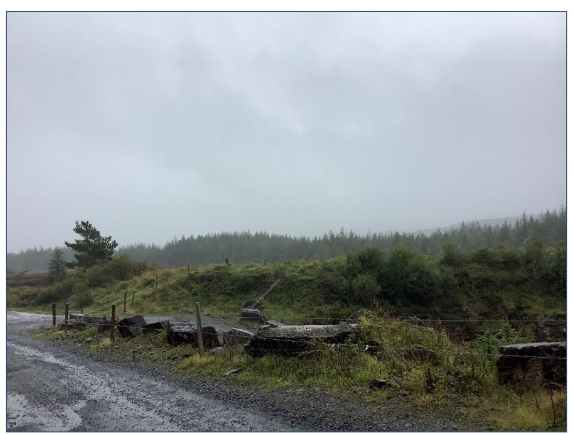
Plate 13.76: General context of borrow pt along access road to east looking southwest.