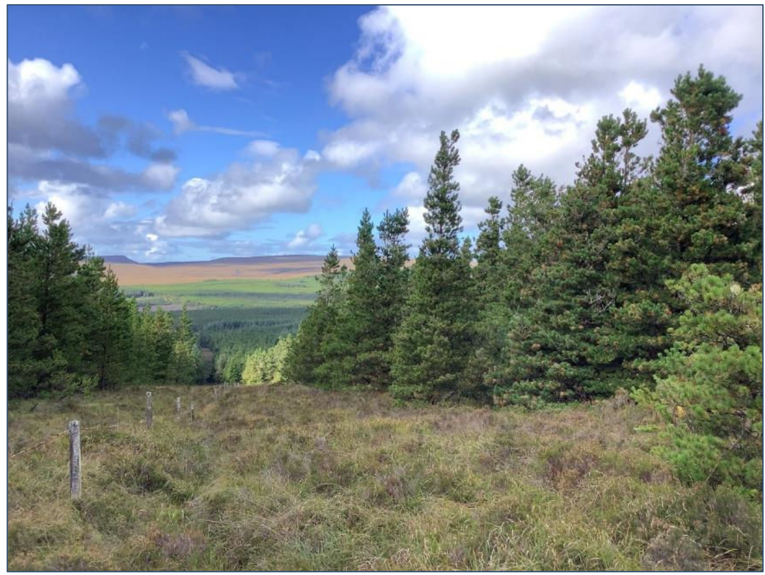
Plate 13.27: View NNW from EIAR boundary. Turbine 14 within mature dense forestry to right of photo.