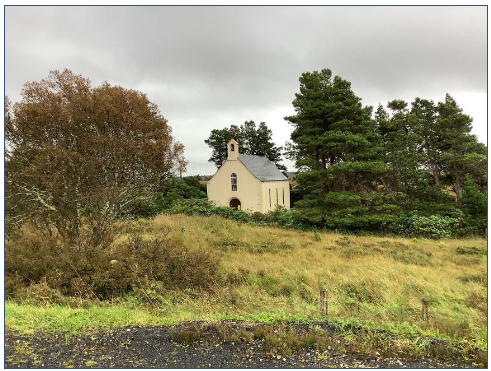
Plate 13.84: Catholic Church of our Lady NIAH 31302701 located along the TDR at Tawnaghmore [Err. By.] TD.