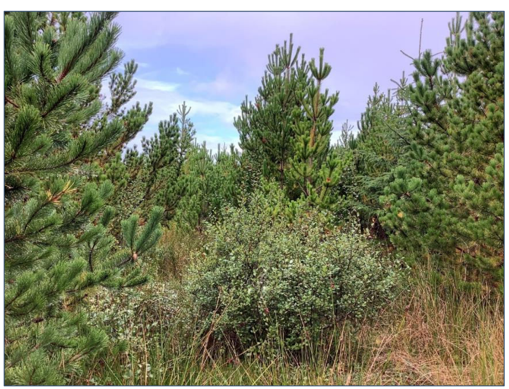
Plate 13.17: Proposed road to T8 taken from turbine location looking NW.