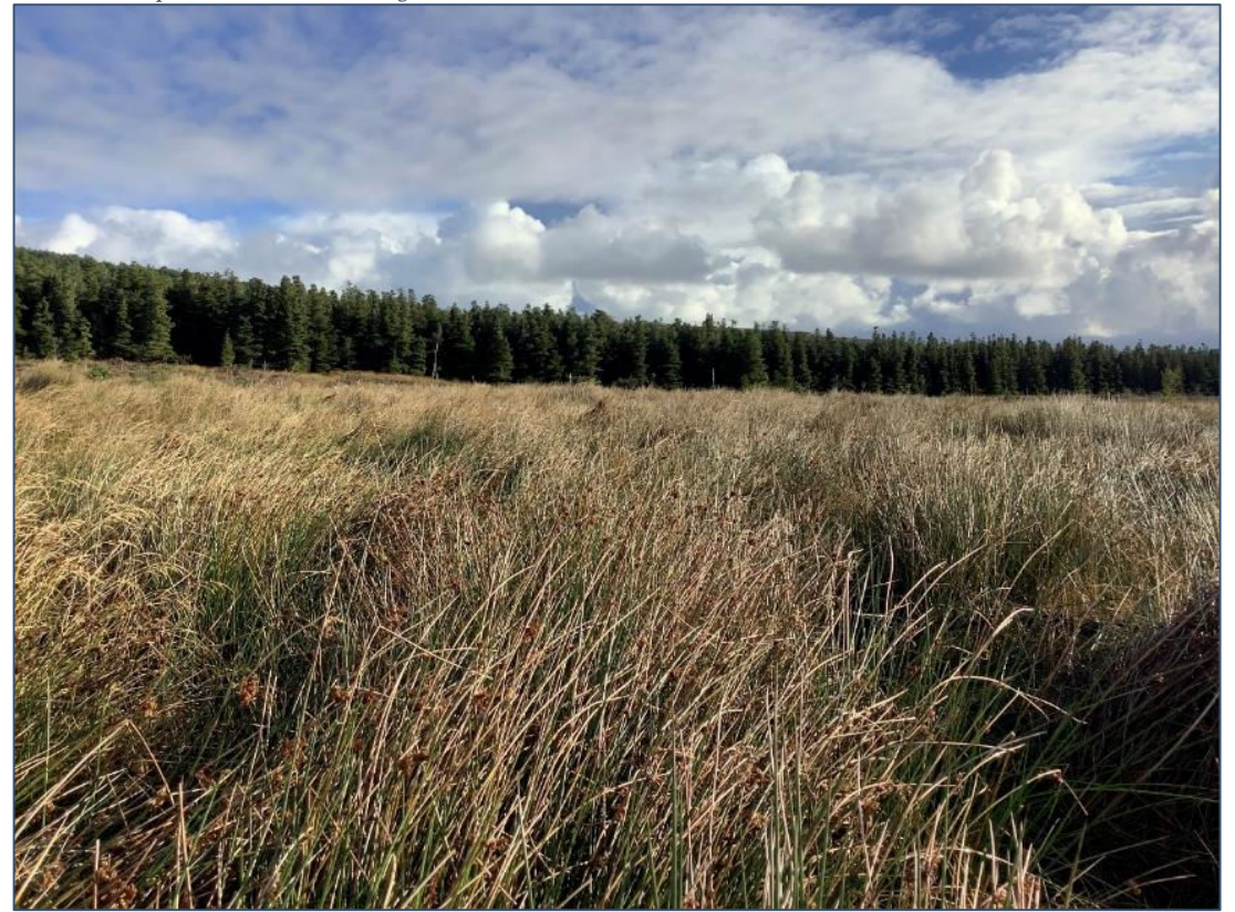
Plate 13.34: Proposed road to T16 looking NE.